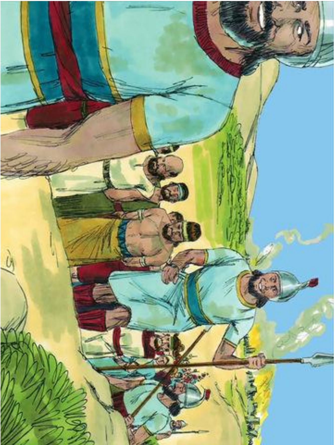
FreeBibleimages :: The fall of Jerusalem :: Babylonians destroy Jerusalem and take the Jews into exile (2 Kings 24:1 - 25:26)