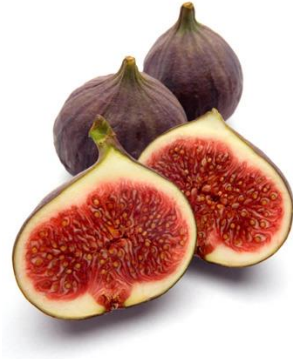
Figs (“summer fruit”)