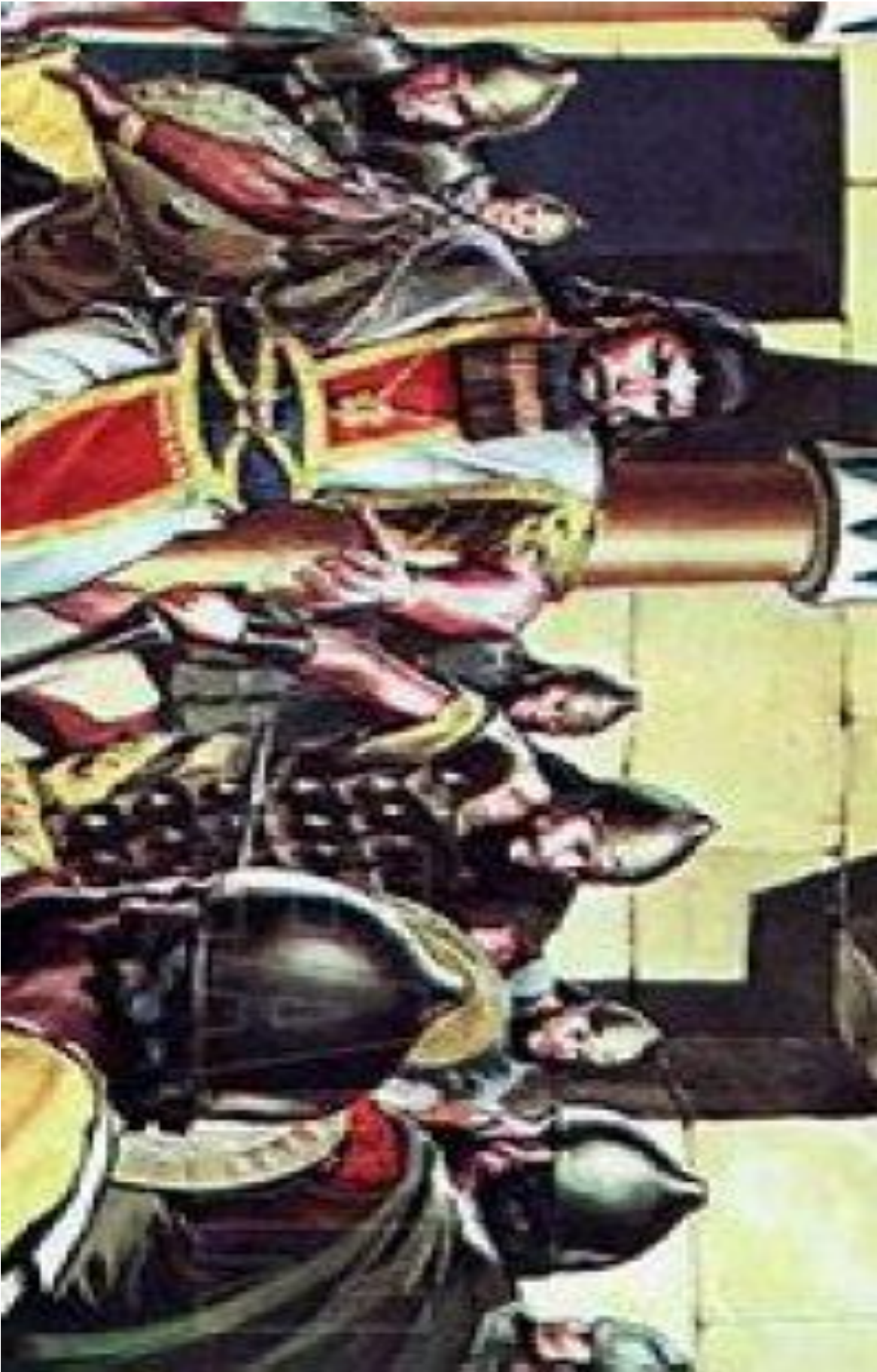
Blog – Gedaliah: Governor of Judah (onochurch.org)