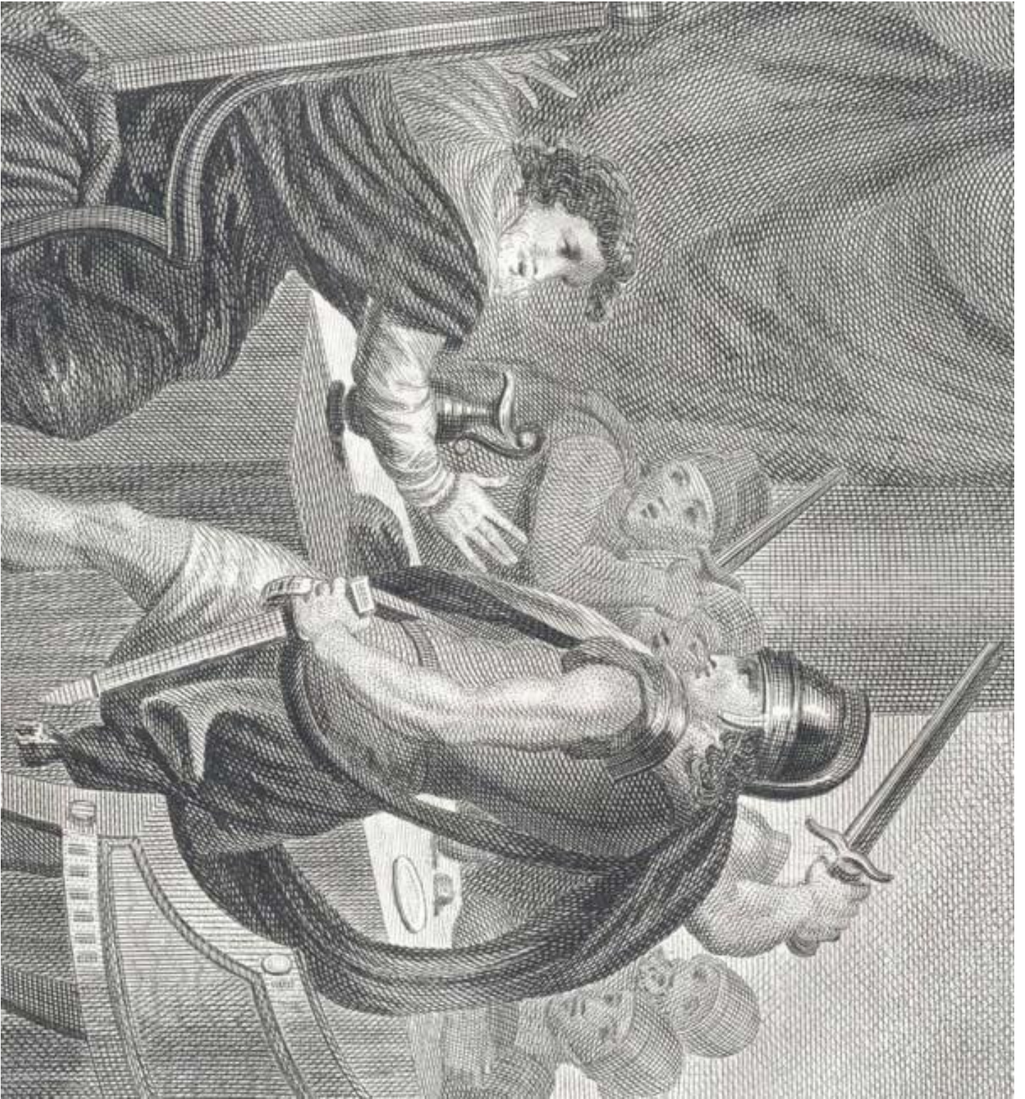
Ishmael Slaying Gedaliah - 2 Kings