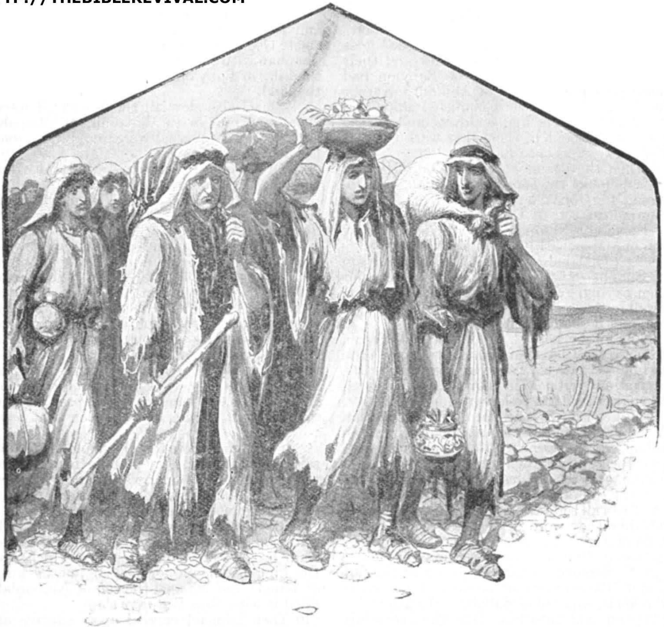
"There came certain from Shechem, from Shiloh, and from Samaria."— Jer. xli. 5.