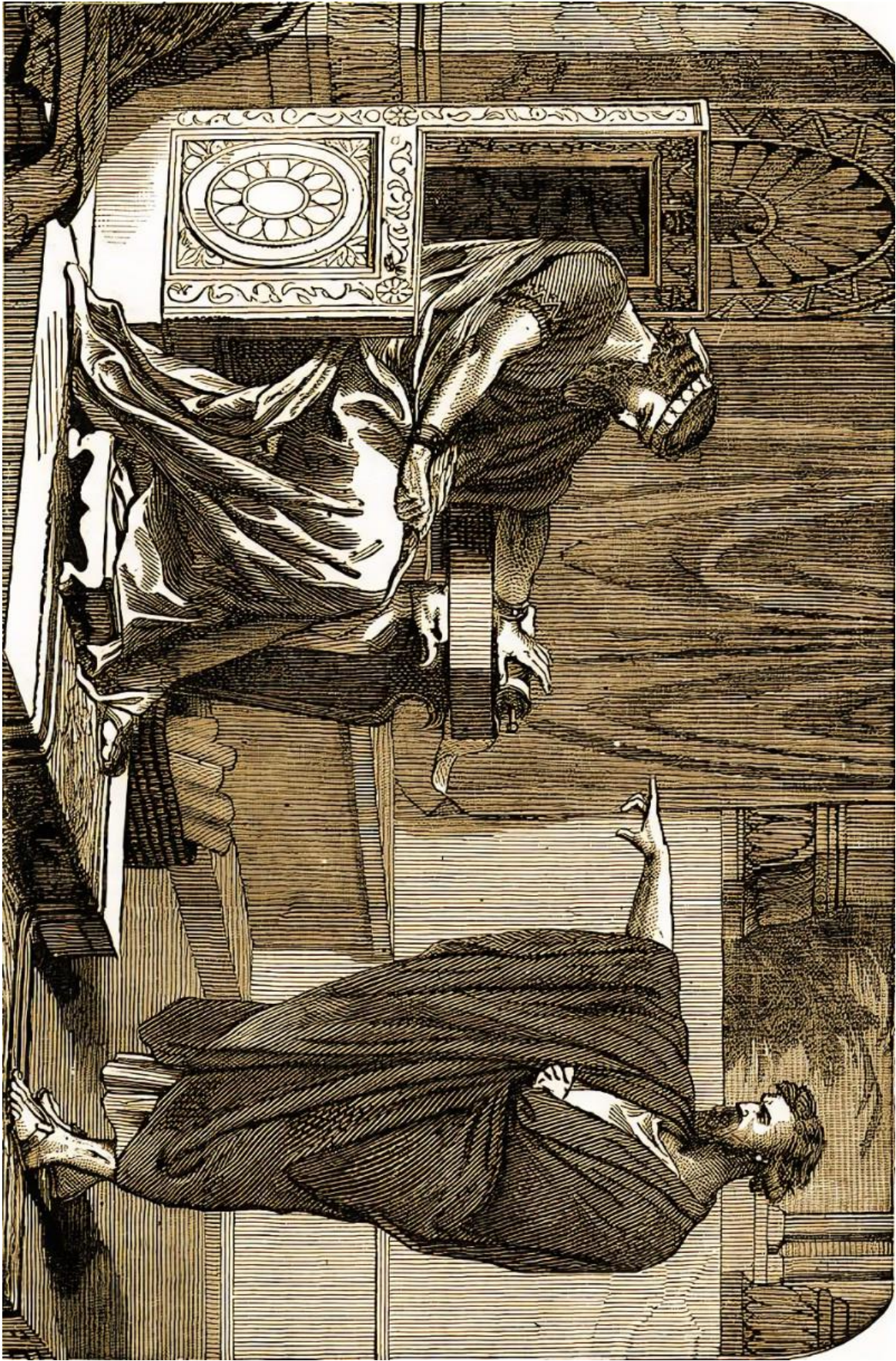
SEDER OLAM REVISITED - Chronology of the Bible and beyond (seder-olam.info)