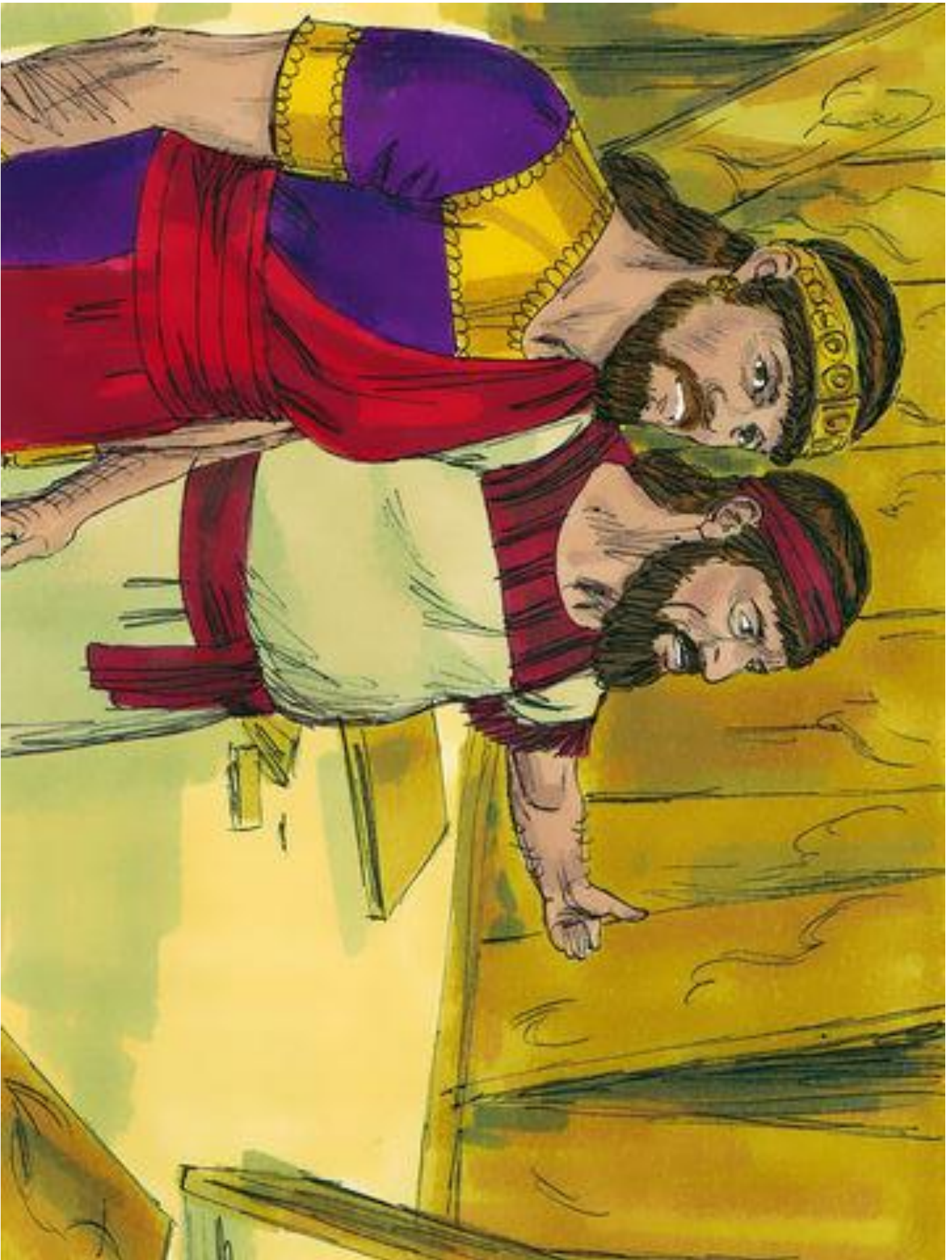
FreeBibleimages :: Joash the boy king :: Joash becomes king of Judah at the age of seven with the help of Jehoiada the priest (2 Kings 11:1 - 12:21)