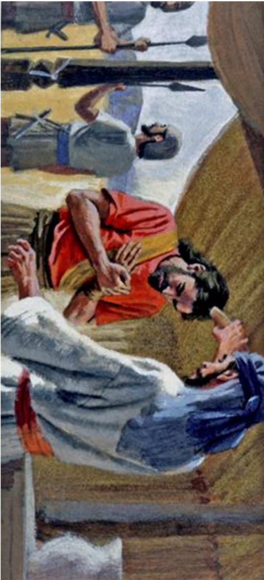
The Bible In Paintings, #150: KING JEHU & JEZEBEL'S DEATH (freerepublic.com)