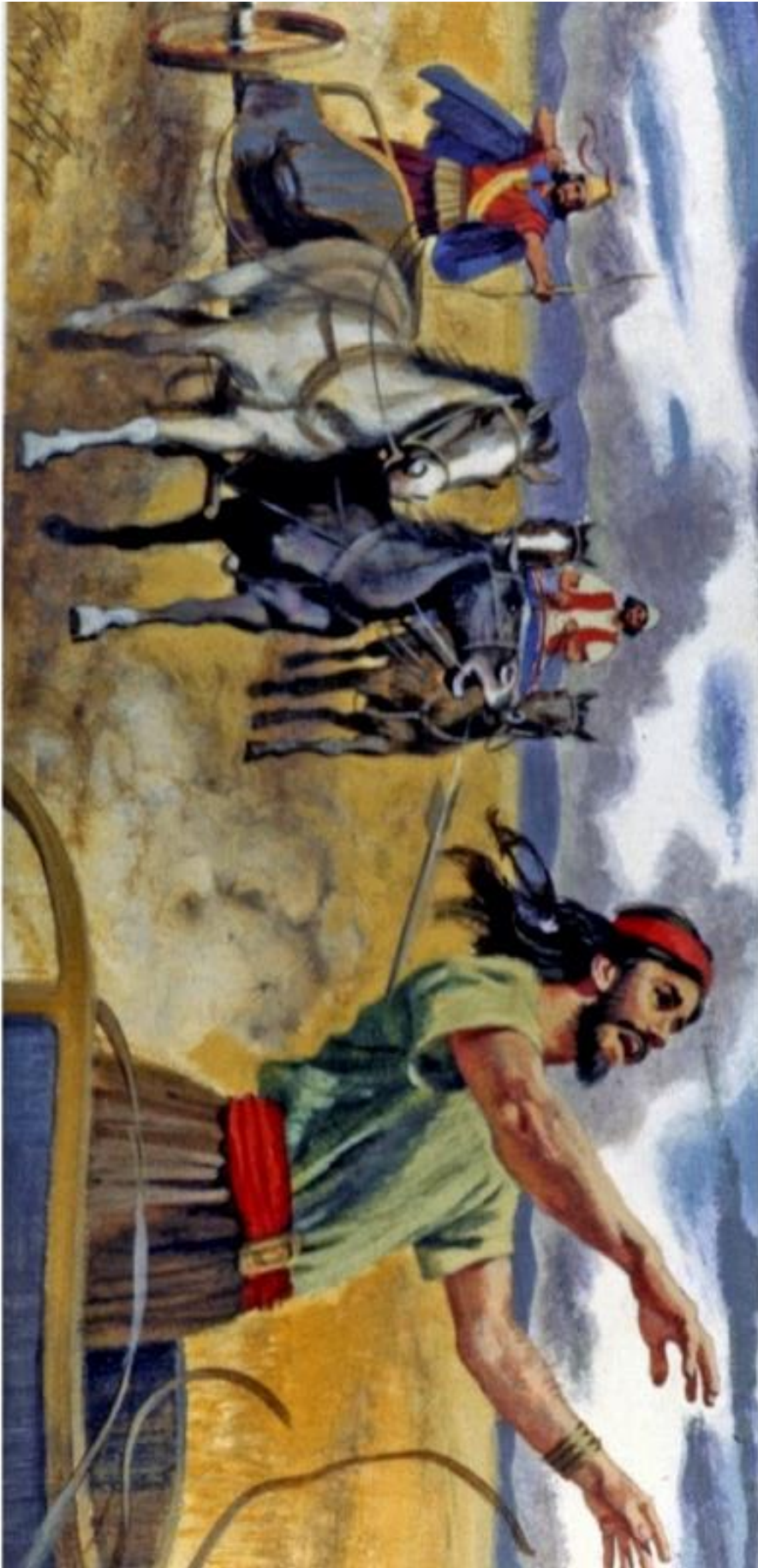
The Bible In Paintings, #150: KING JEHU & JEZEBEL'S DEATH