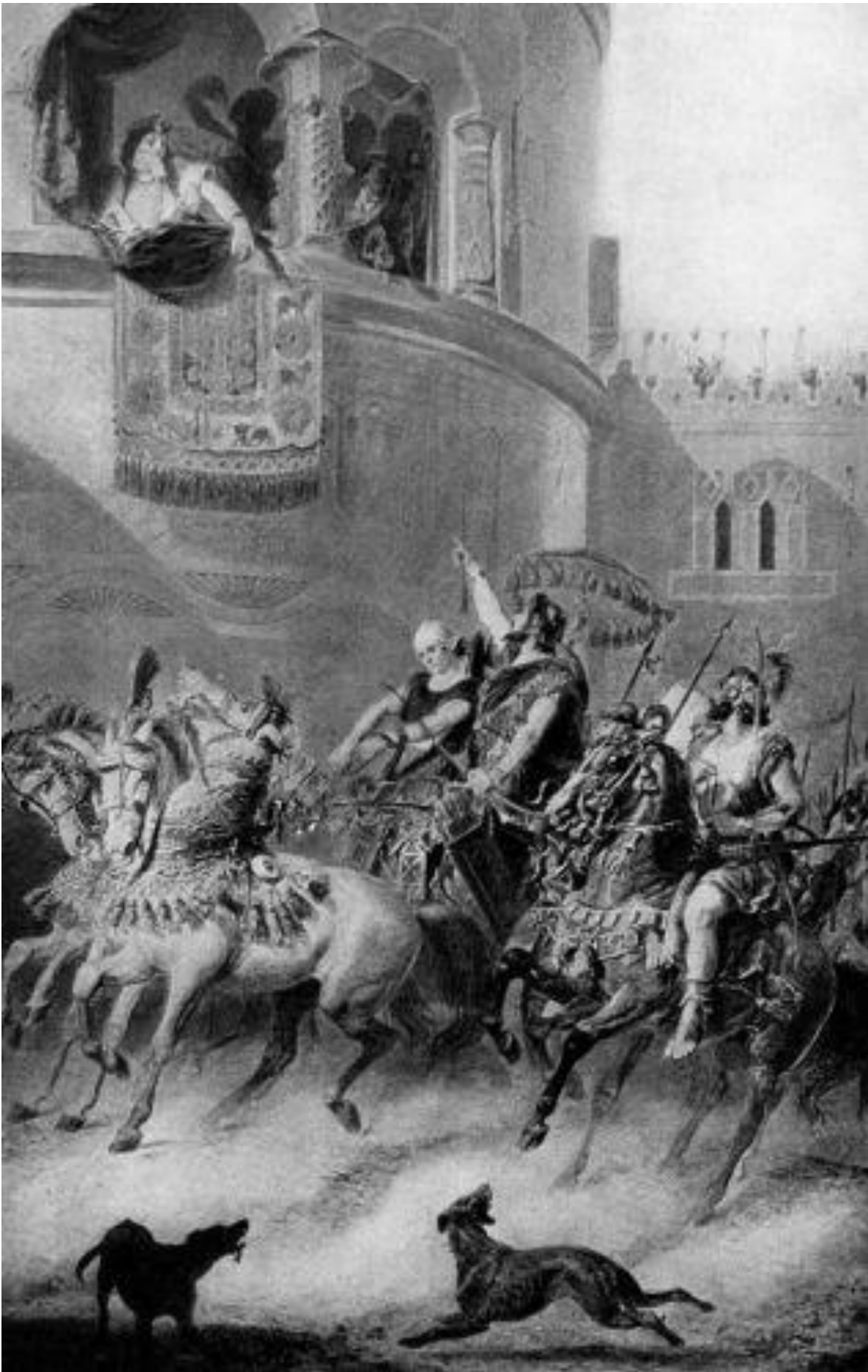
The Bible In Paintings, #150: KING JEHU & JEZEBEL'S DEATH