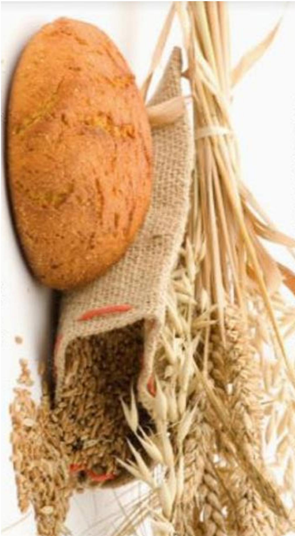
Elisha Feeds 100 Men: A man came from Baal-shalishah, bringing food from the first fruits to the man of God: twen... | Egészséges, Egészséges táplálkozás, Táplálkozás (pinterest.ch)