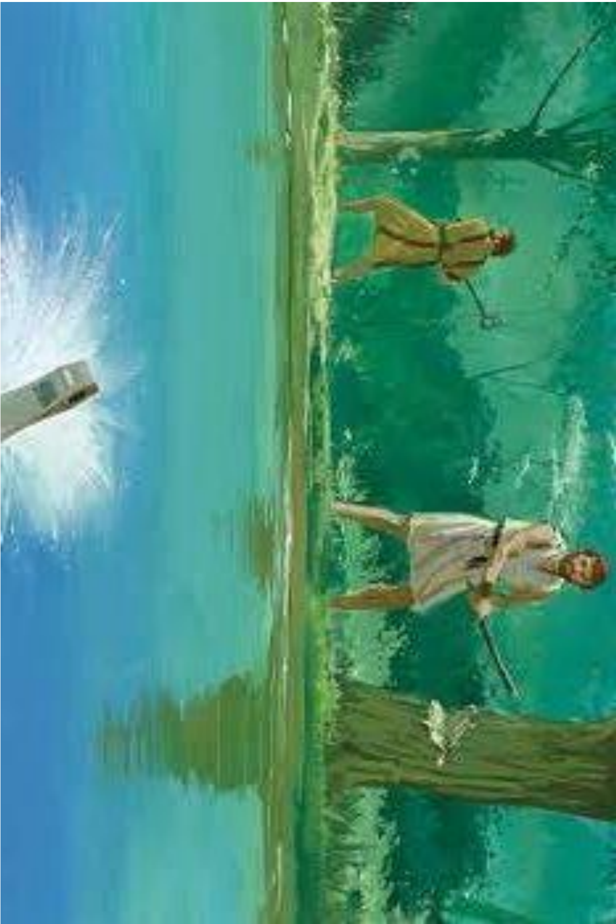
#89 – The Sons Of The Prophets Lived In Dormitories – Good News for Israel