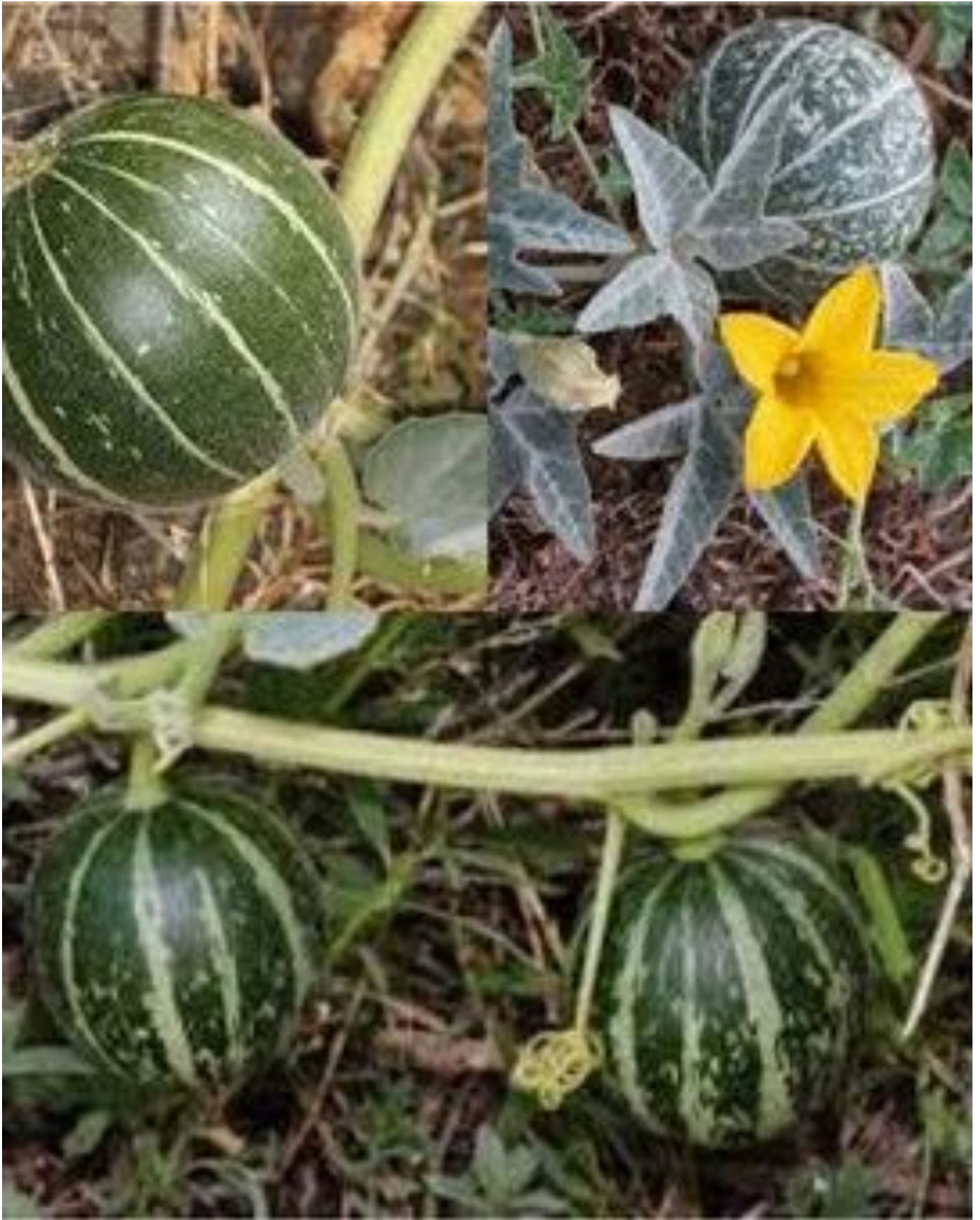
Buffalo Gourd | Etsy