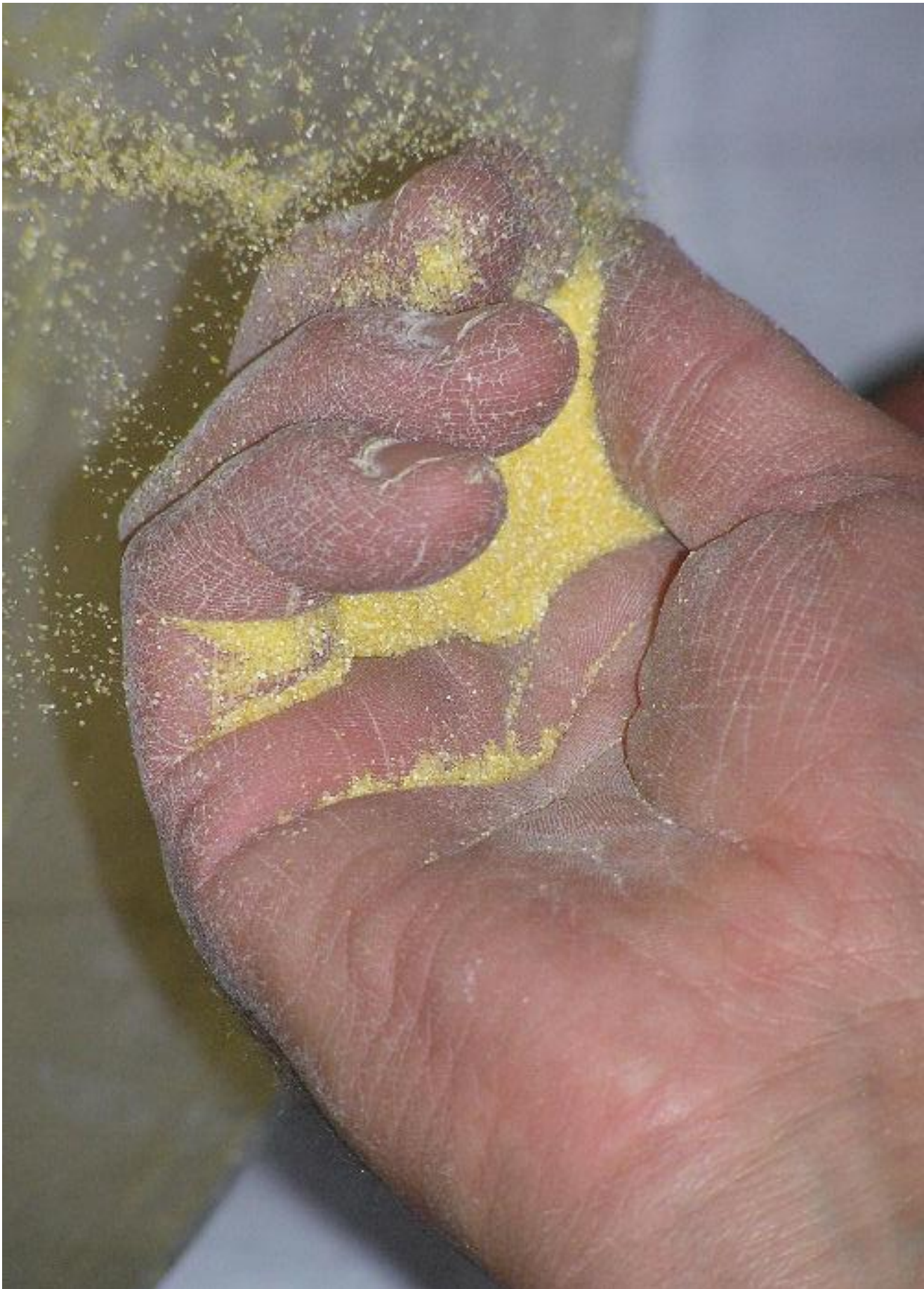
Casting In The Meal | Dealing With The Death In The Pot (newtestamentpattern.net)