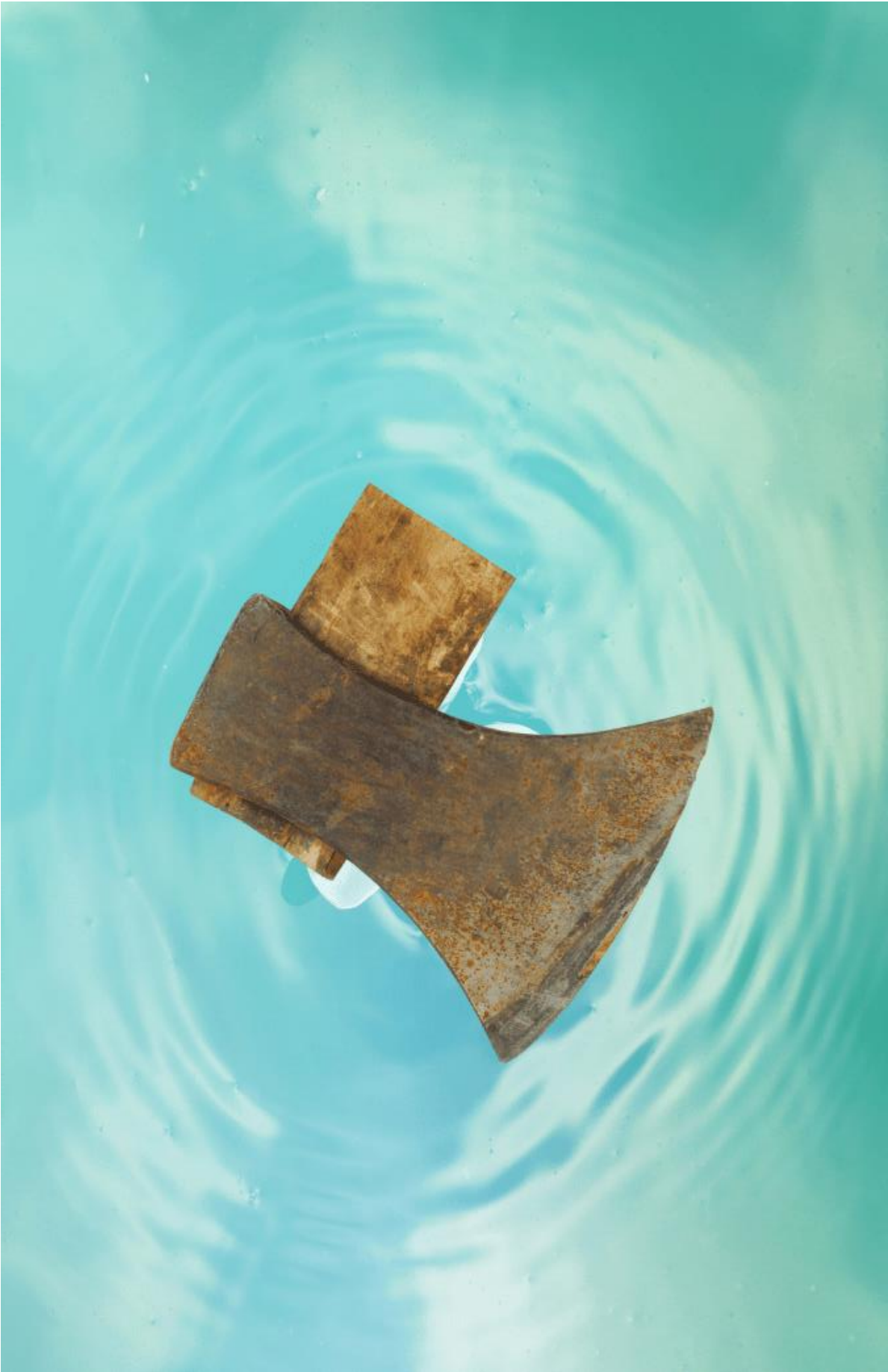
The Miracle of the Floating Axhead – The Next Step Community (findmynextstep.org)