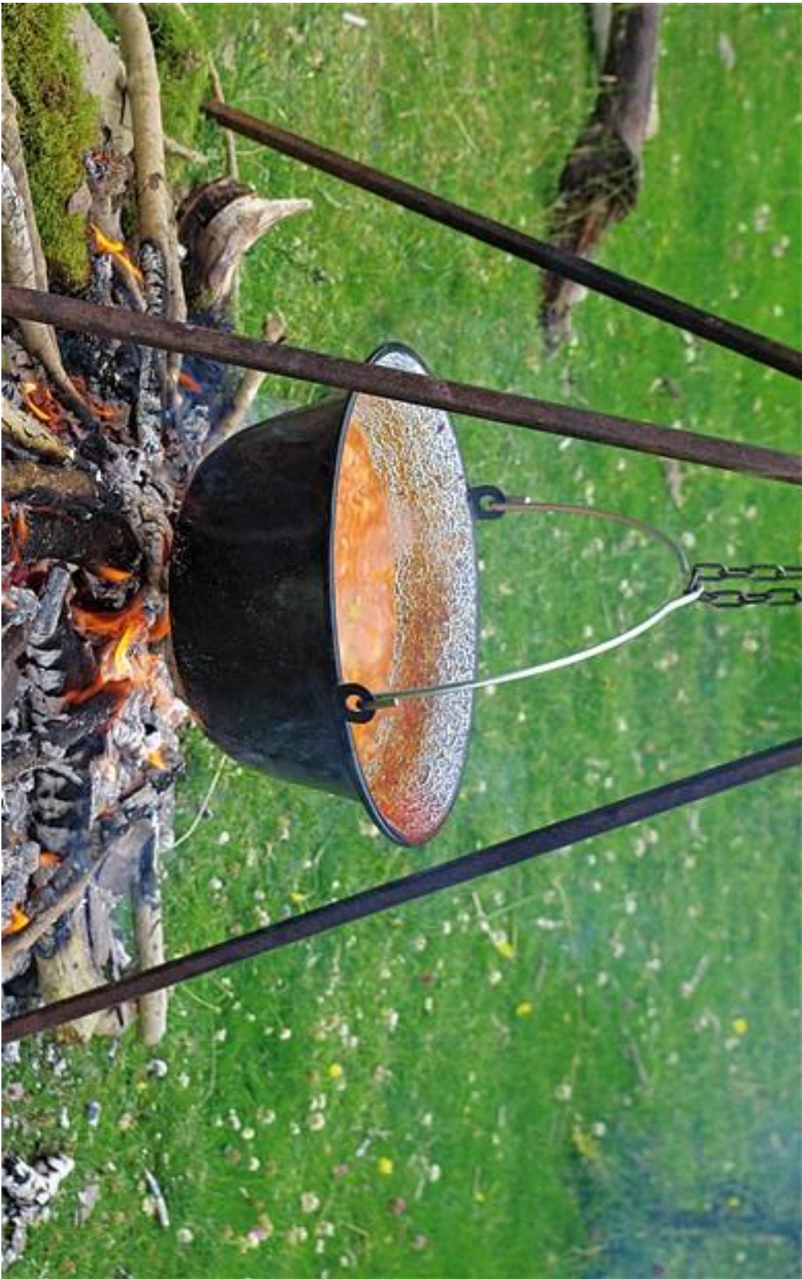
It Was Food Poisoning! | ThePreachersWord