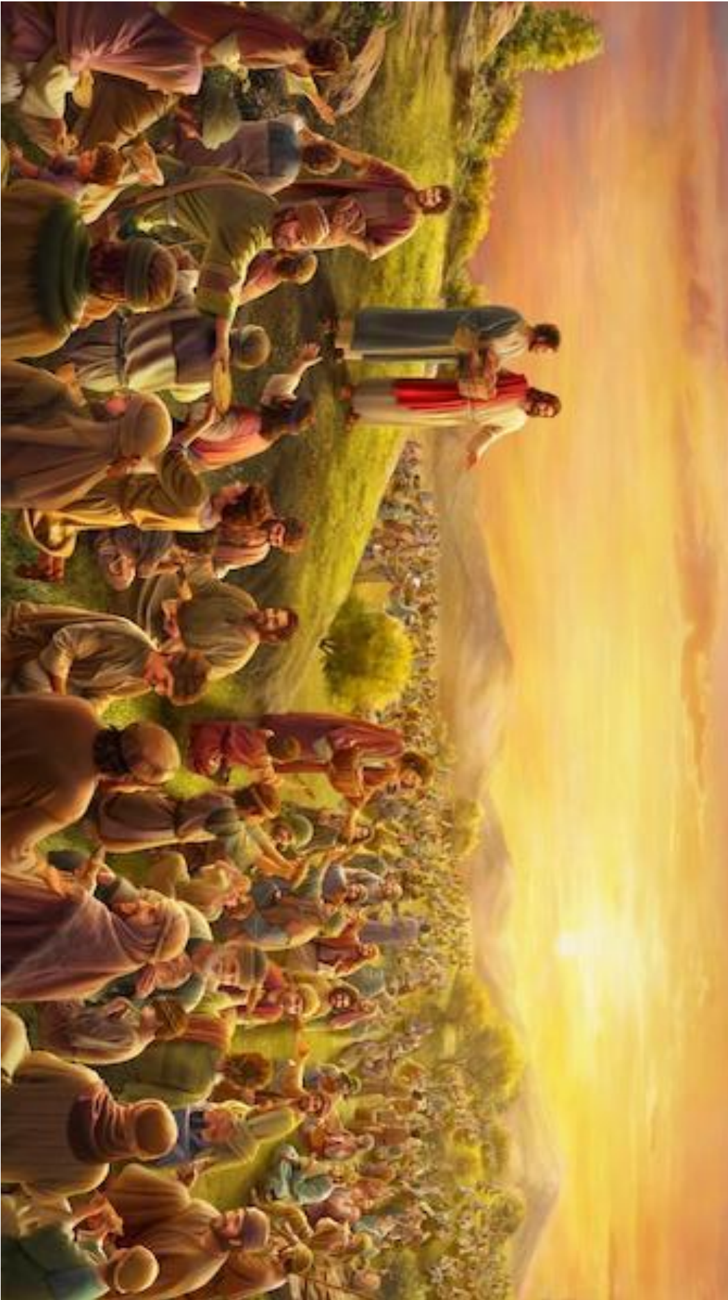
The Miracle of the Lord Jesus Feeding 5,000 People: What Is His Will? (hearthymn.com)