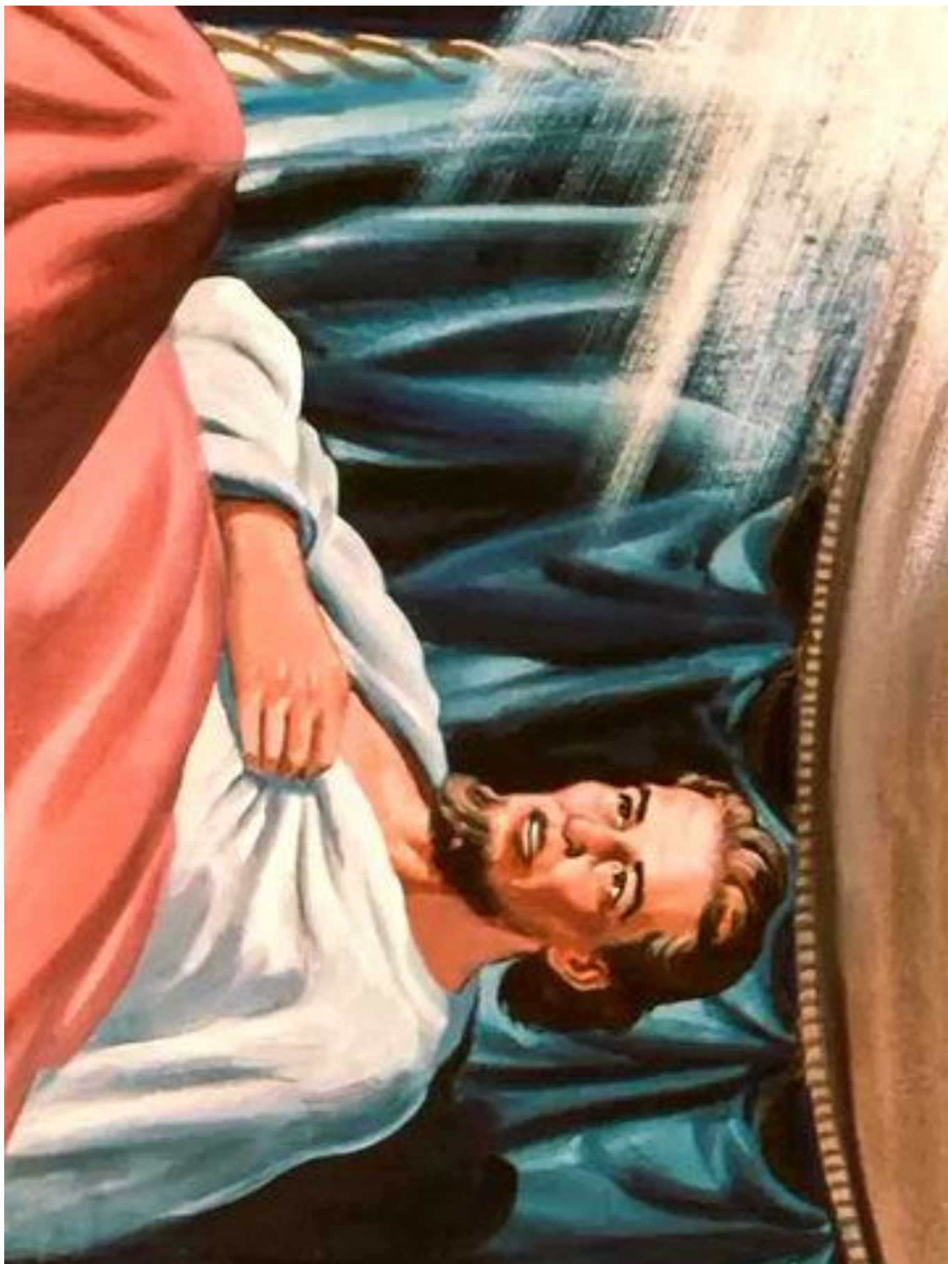
FreeBibleimages :: The wisdom of Solomon :: Solomon asks God for wisdom (1 Kings 1-10, 2 Chronicles 1-9)