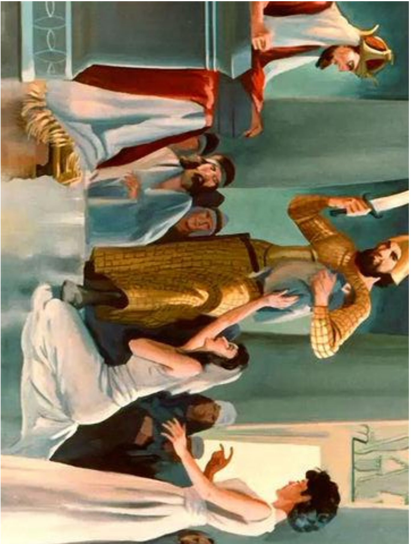
FreeBibleimages :: The wisdom of Solomon :: Solomon asks God for wisdom (1 Kings 1-10, 2 Chronicles 1-9)