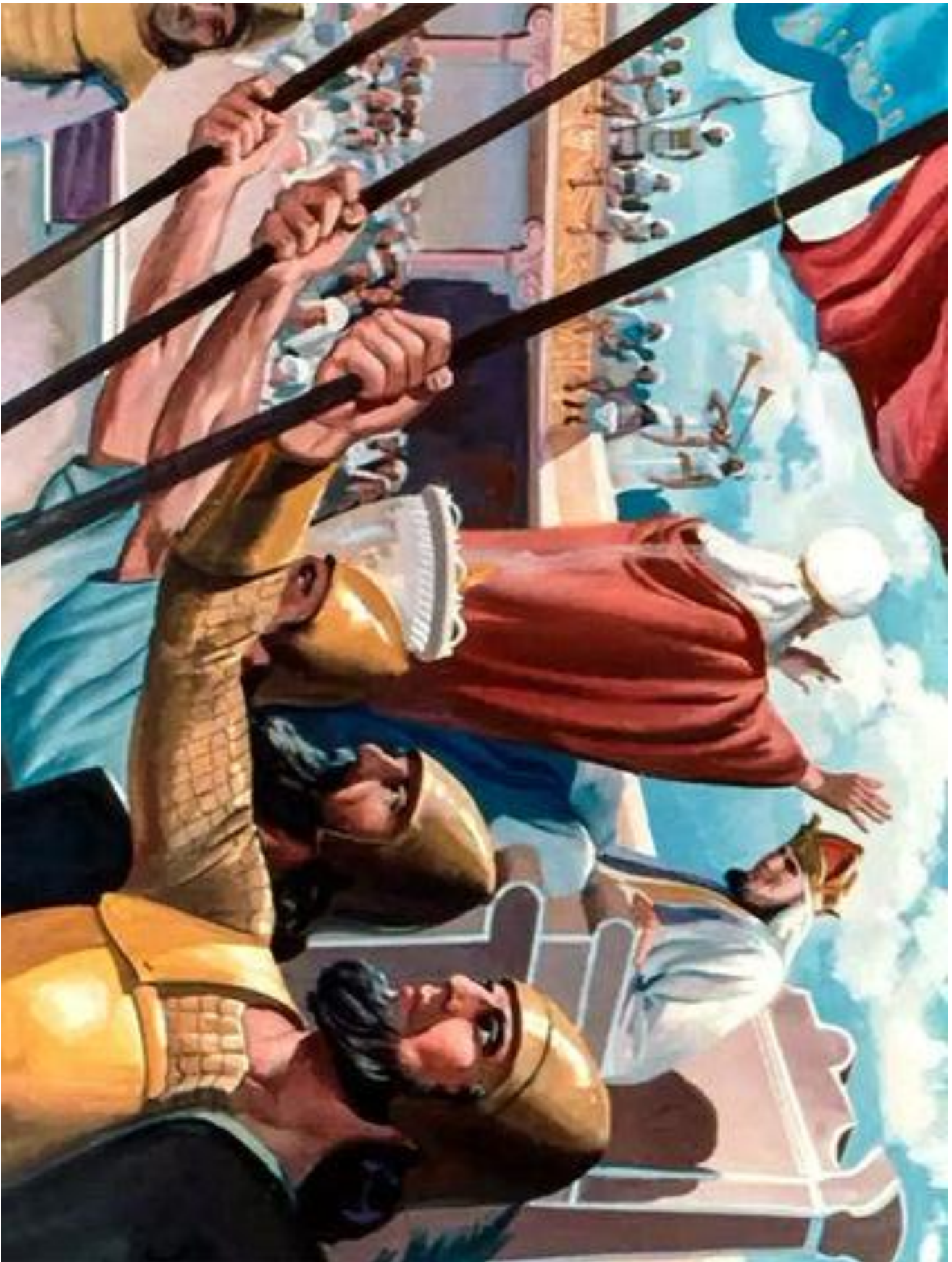
FreeBibleimages :: The wisdom of Solomon :: Solomon asks God for wisdom (1 Kings 1-10, 2 Chronicles 1-9)