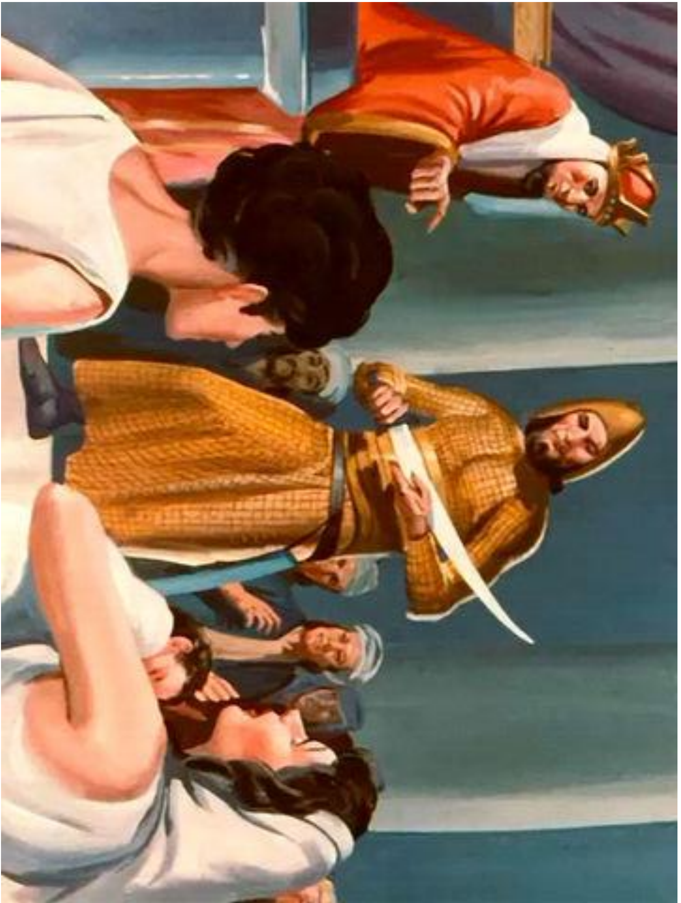
FreeBibleimages :: The wisdom of Solomon :: Solomon asks God for wisdom (1 Kings 1-10, 2 Chronicles 1-9)