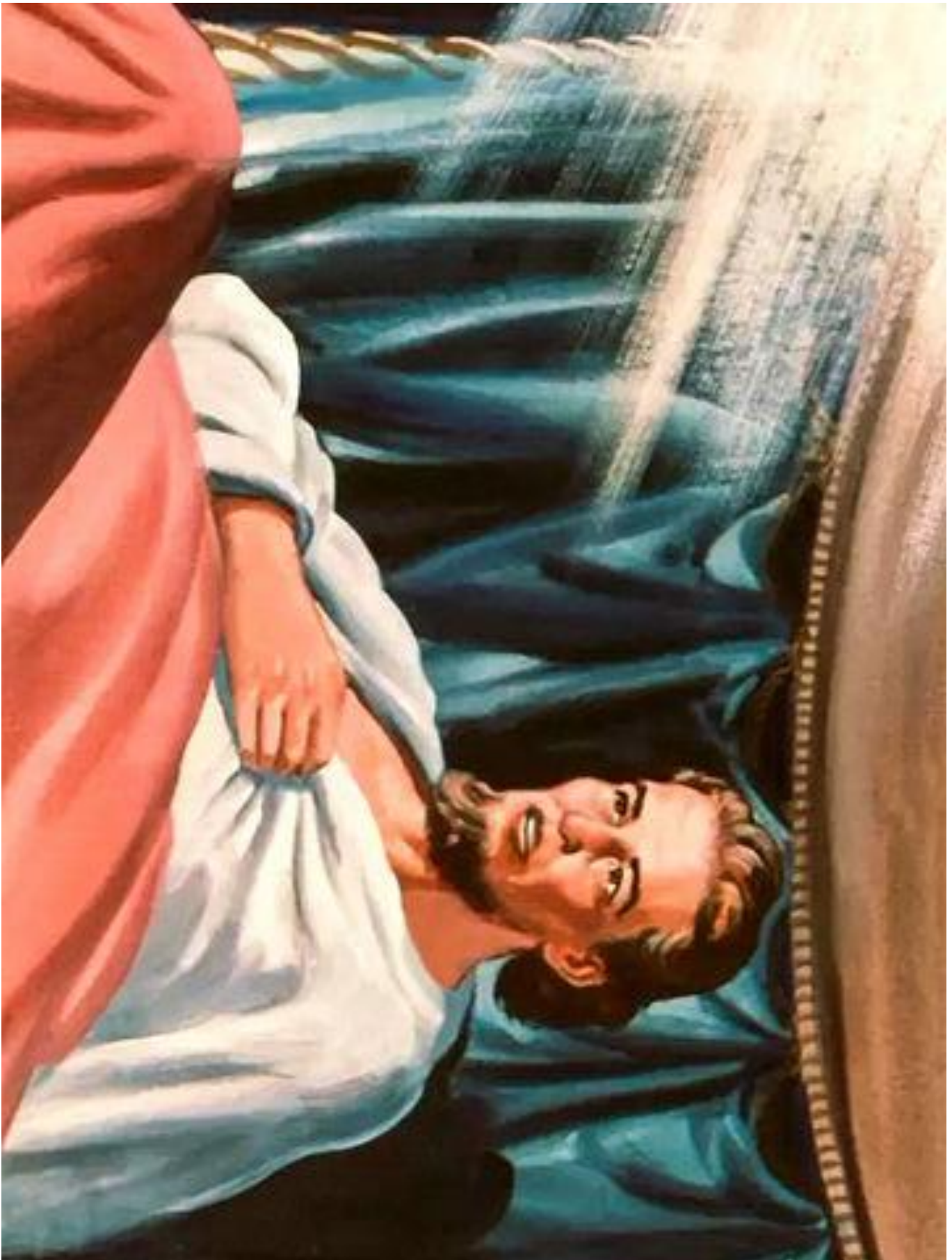
FreeBibleimages :: The wisdom of Solomon :: Solomon asks God for wisdom (1 Kings 1-10, 2 Chronicles 1-9)