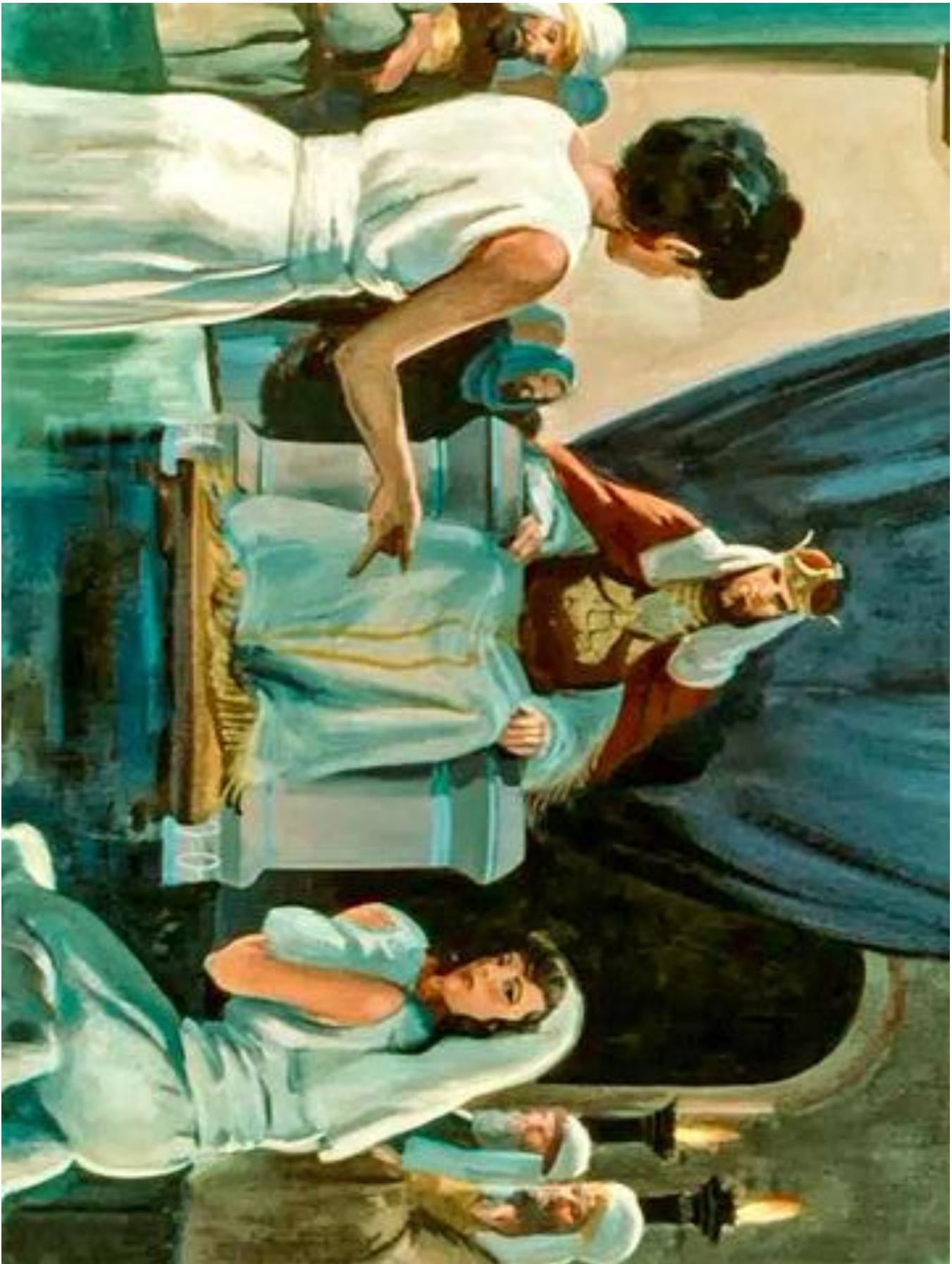
FreeBibleimages :: The wisdom of Solomon :: Solomon asks God for wisdom (1 Kings 1-10, 2 Chronicles 1-9)