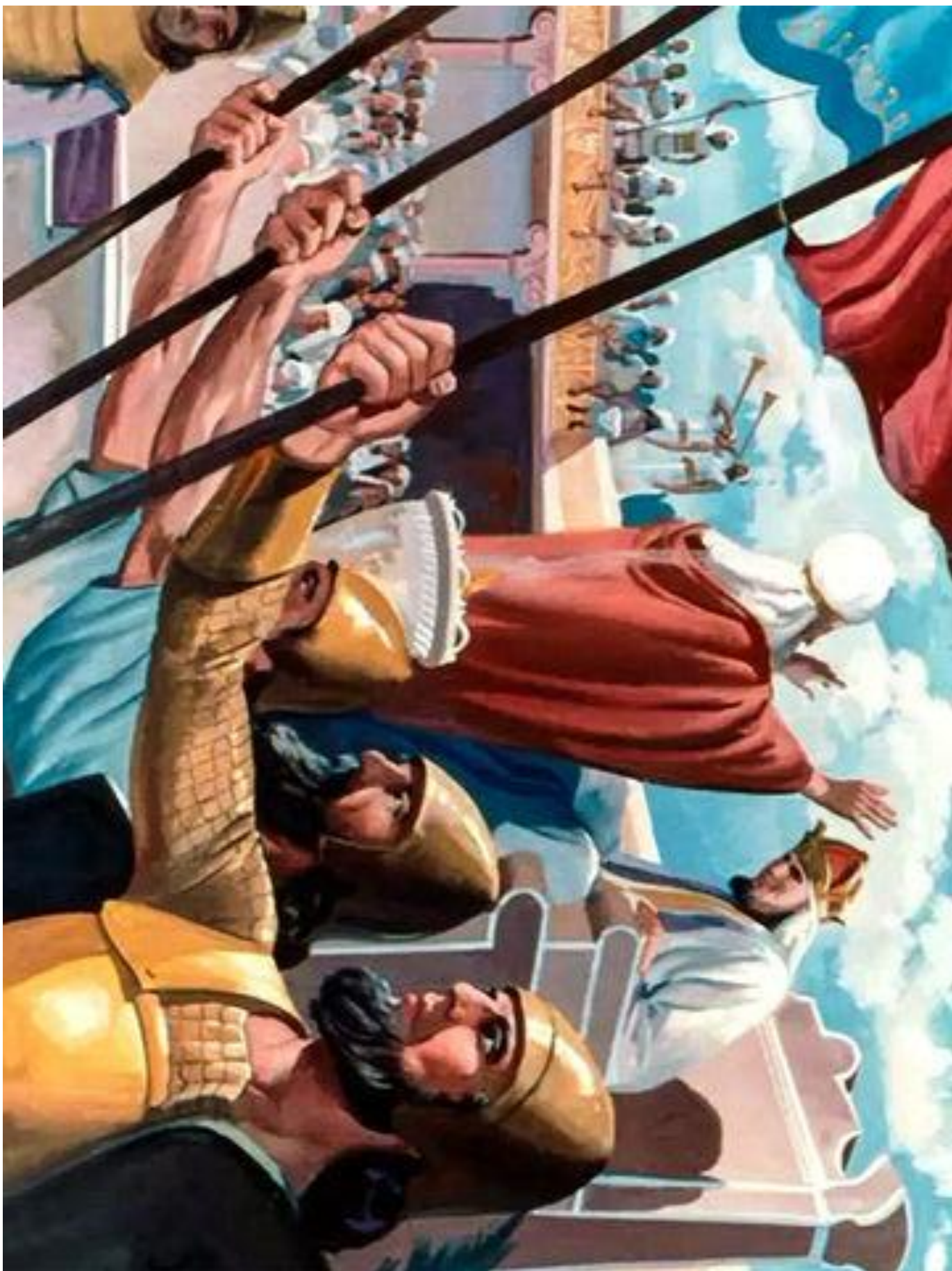
FreeBibleimages :: The wisdom of Solomon :: Solomon asks God for wisdom (1 Kings 1-10, 2 Chronicles 1-9)