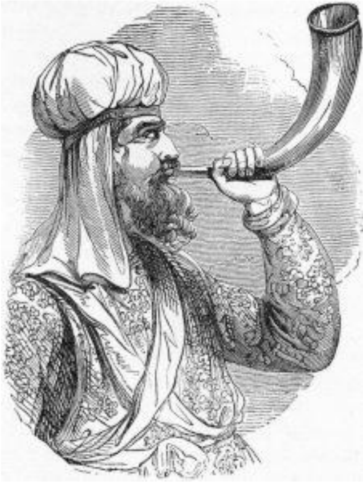
Blow the Trumpets in Zion: The Silver Trumpets - hebrewversity