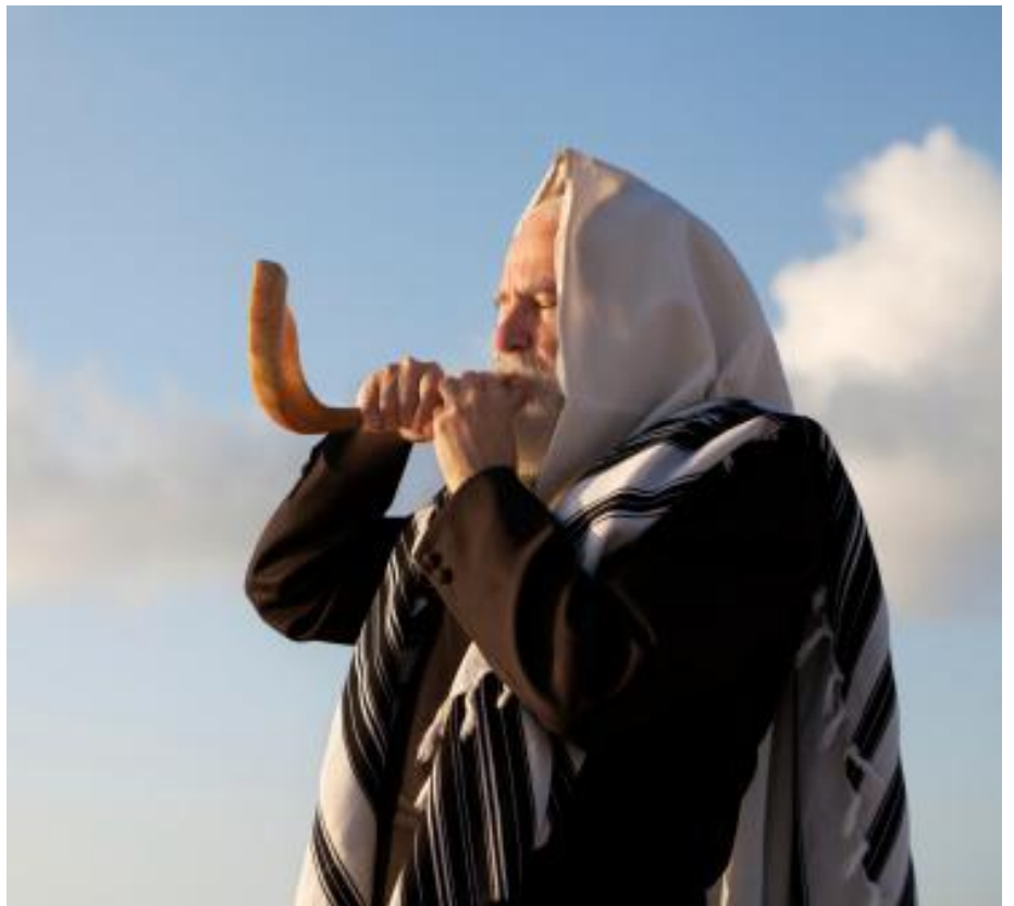
elder-jewish-man-blowing-a-shofar-on-rosh-hashanah-picture-id168531827 (507×338)