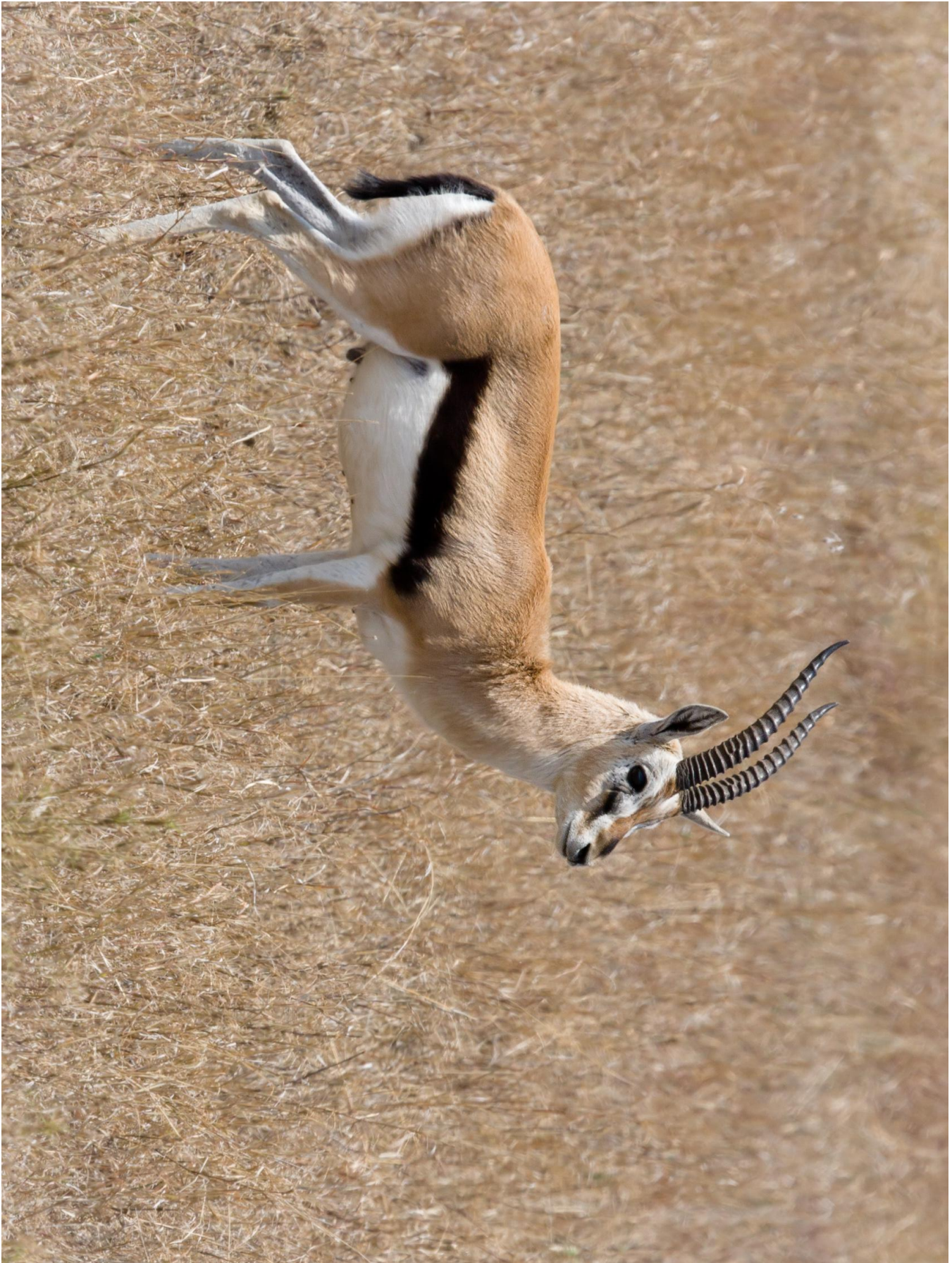
Serengeti_Thomson-Gazelle1.jpg (2254x1690)