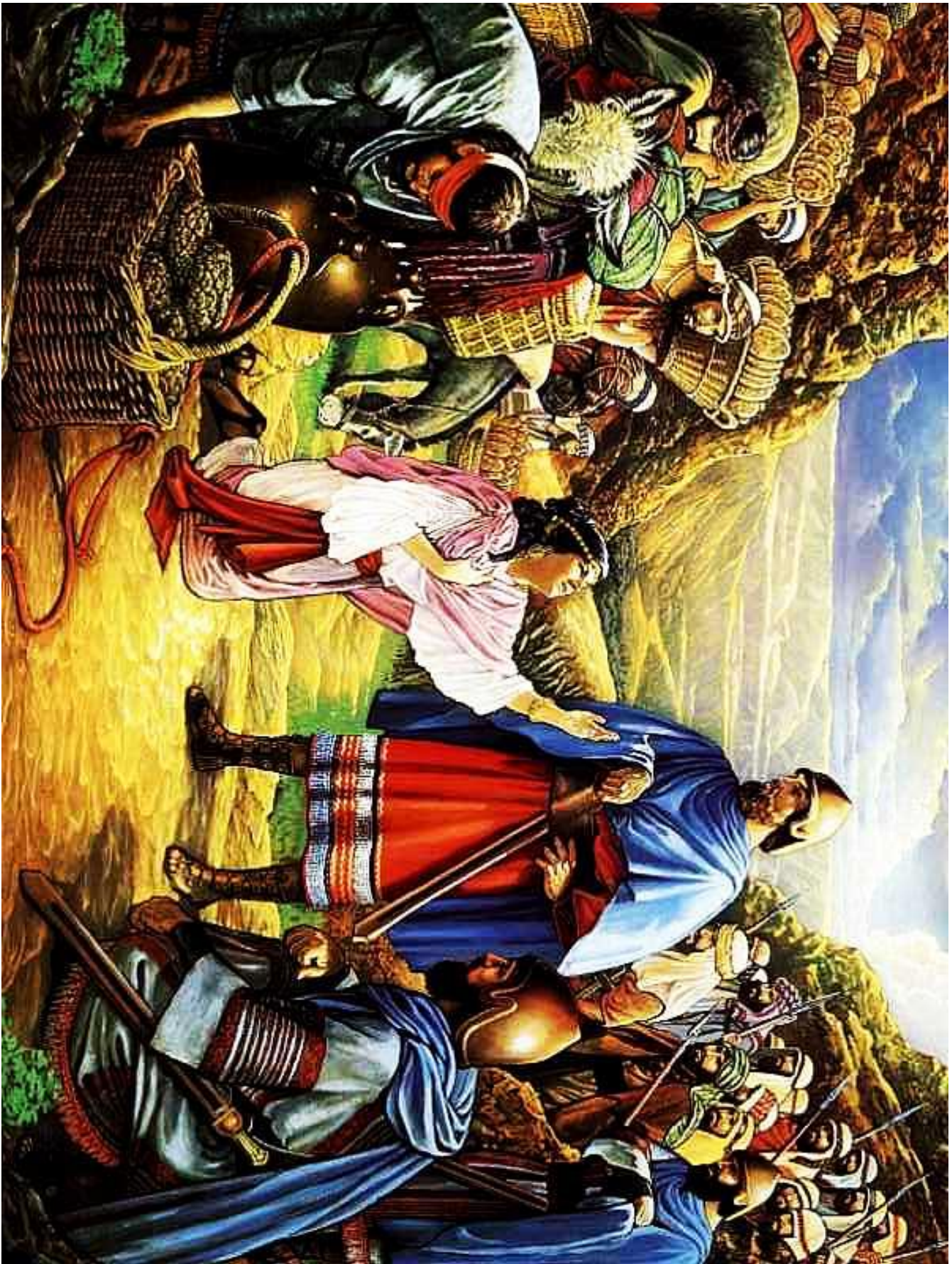
nabal.jpg (800x600) (bibleask.org)