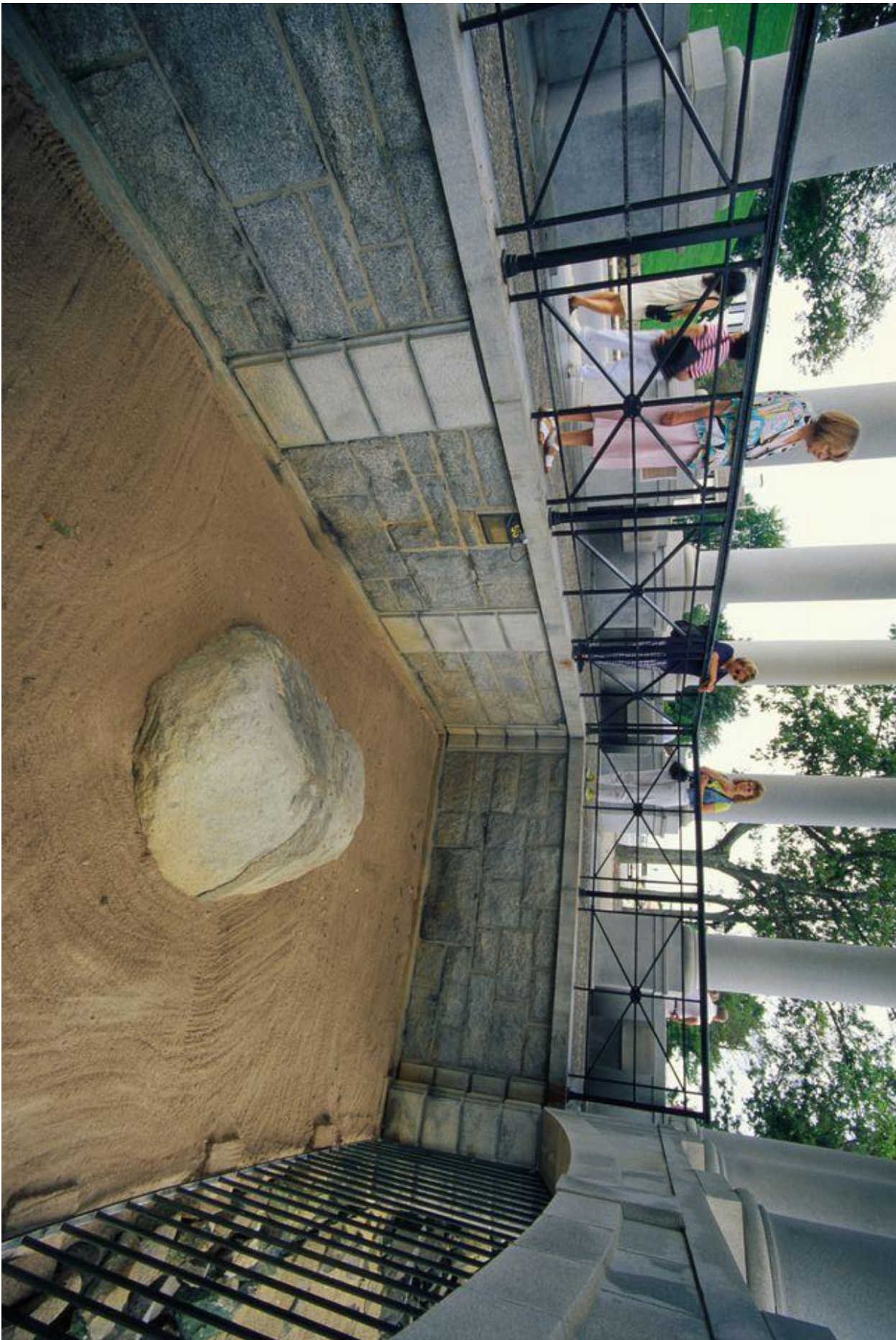
Plymouth Rock ( https://www.tripsavvy.com/visit-the-plymouth-rock-1599133 )