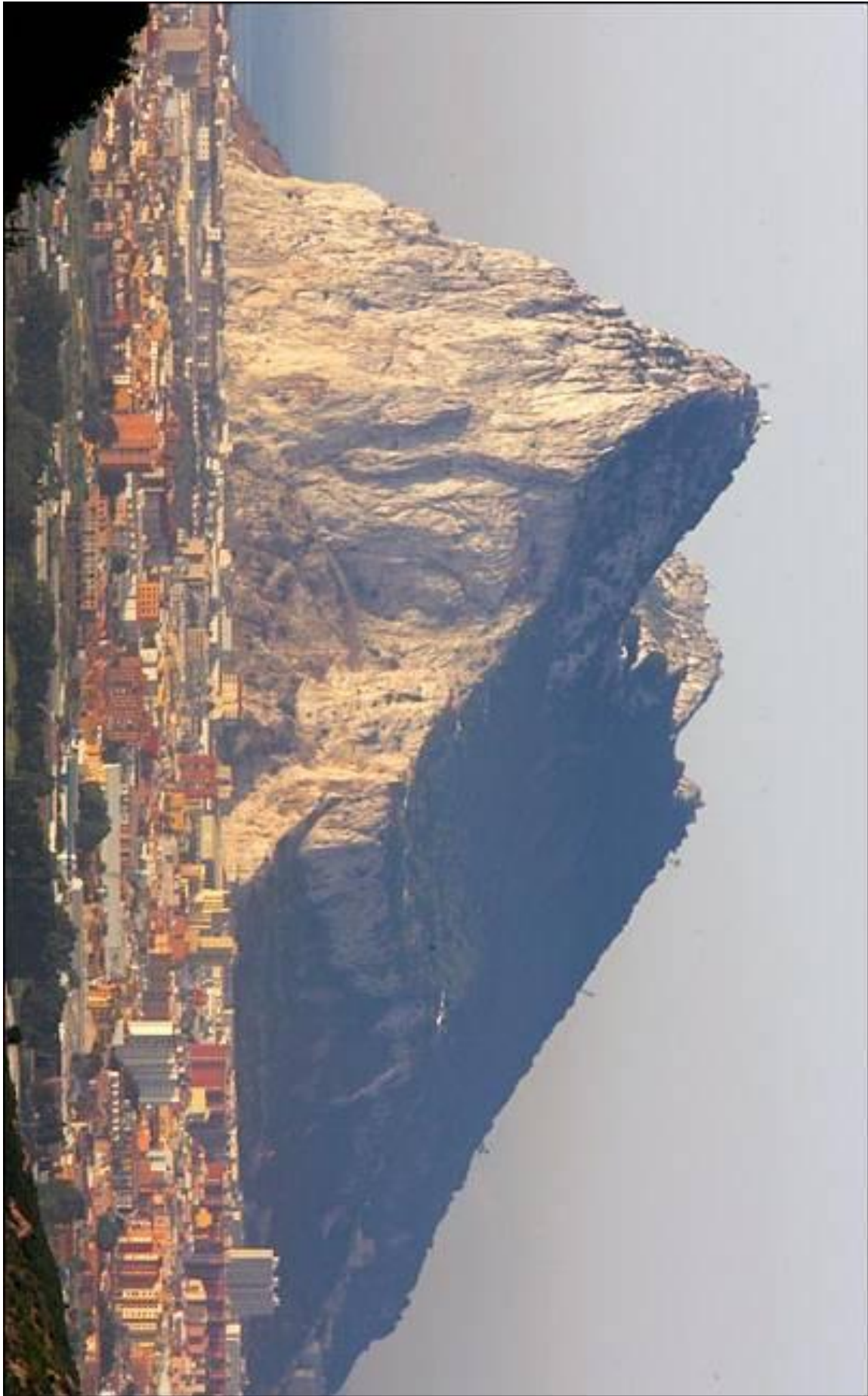
Rock of Gibraltar ( https://www.quora.com/What-does-the-Rock-of-Gibraltar-symbolize )