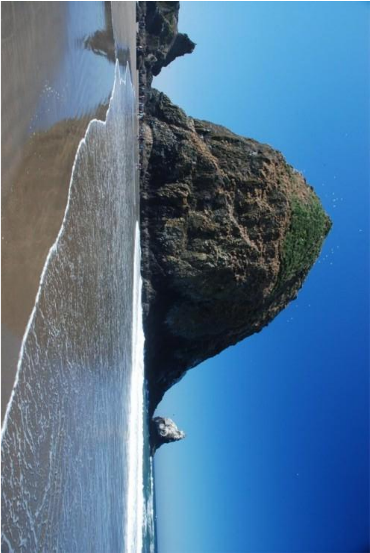
Haystack Rock off the Oregon coast