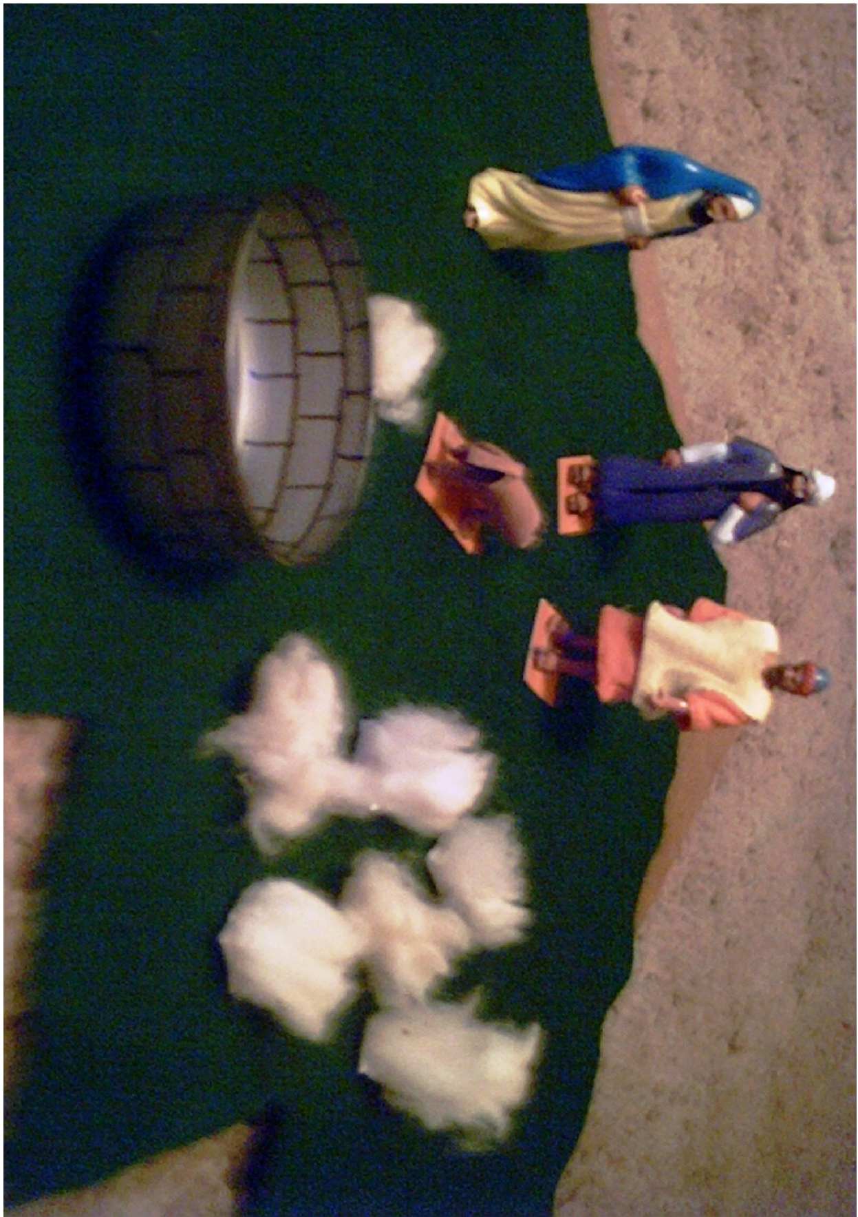
3D presentation of Abimelech part of the story. The well is made from a tuna fish can. The sheep are pieces of sheep skin cut up. The ox is made from a piece of leather stapled to a card stock base. The men are from a set of New Testament people formerly sold through Christian Book Distributors. I don't believe they are available now.