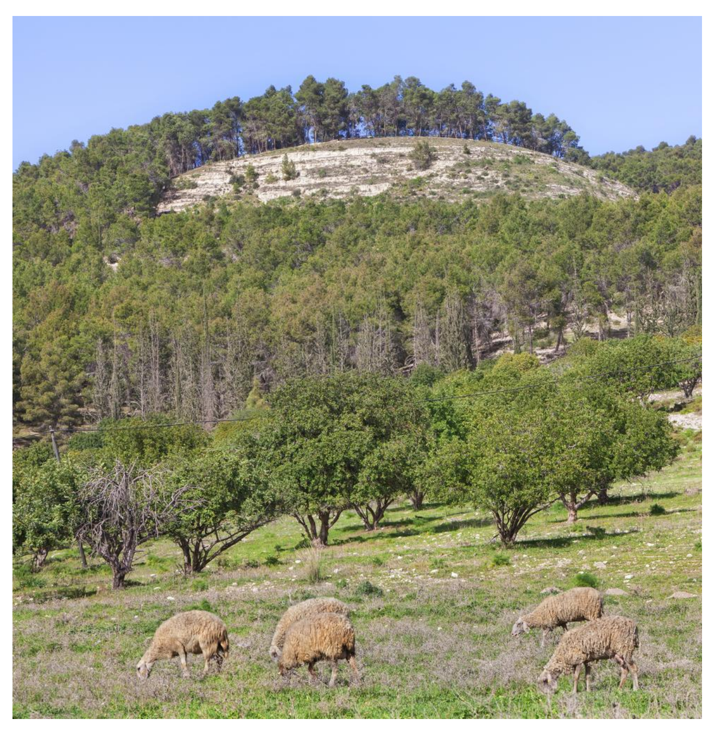
Country around Hebron near the Oaks of Mamre

https://blog.israelbiblical studies.com/holy-land-studies/two-biblical-trees/