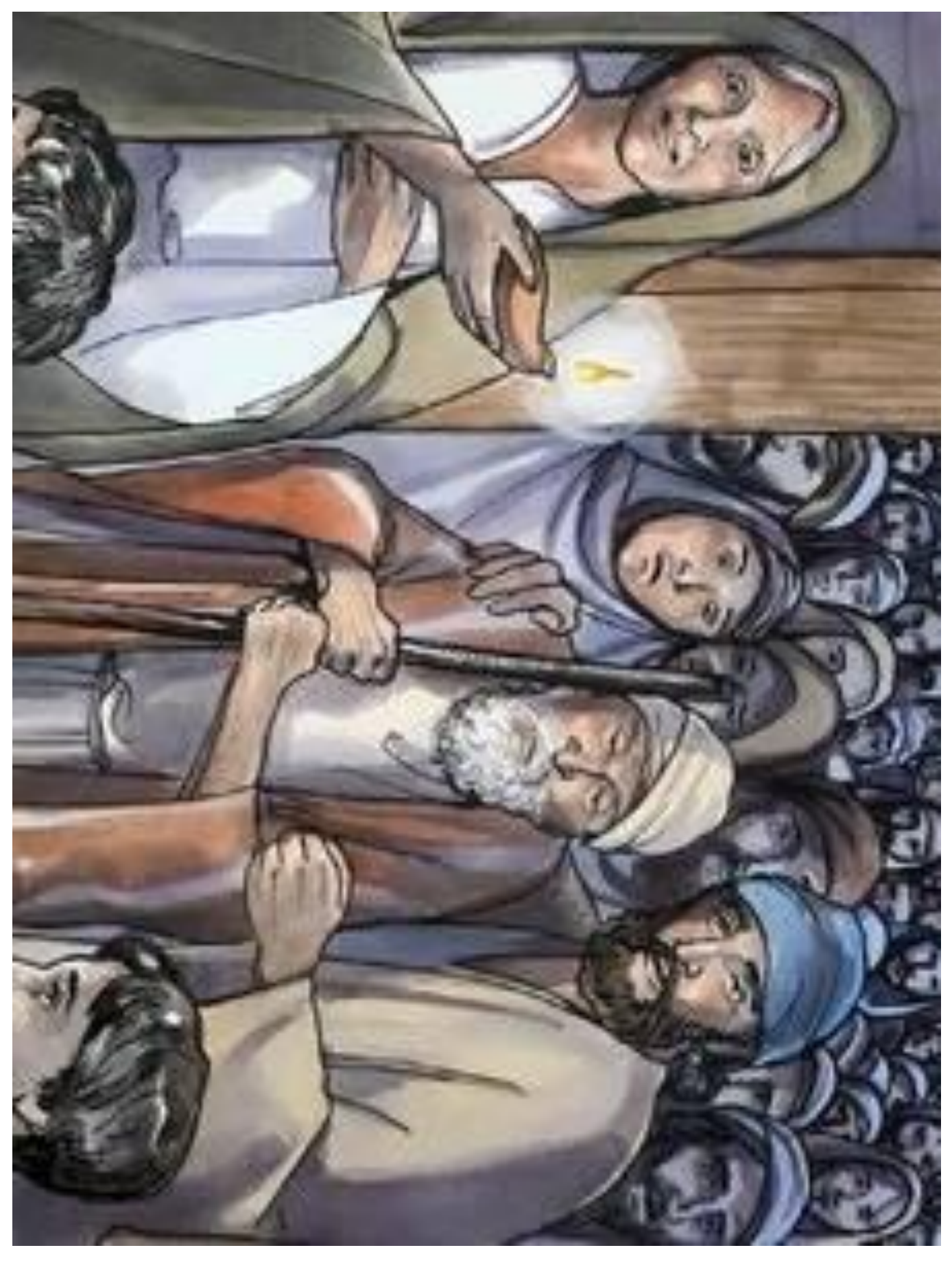
http://www.free bible images.org/illustrations/gnpi-024-peter-mother-in-law/