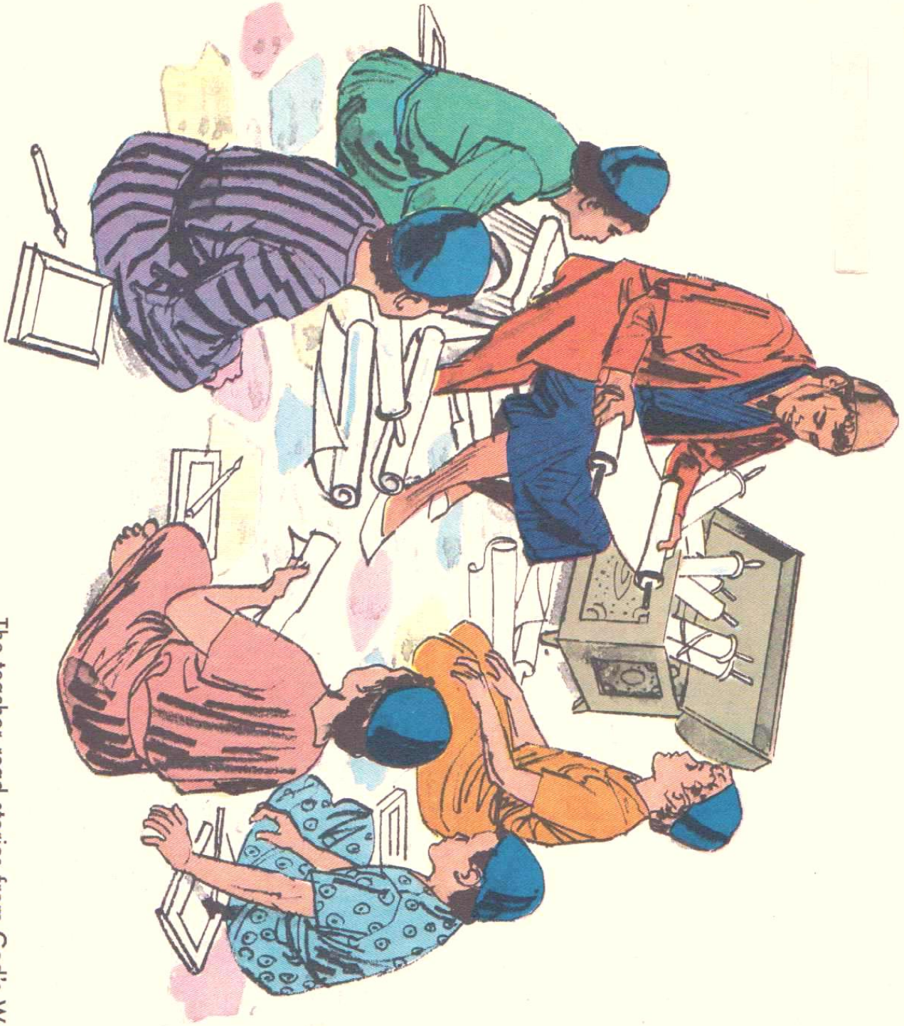
The teacher read stories from God's Word.