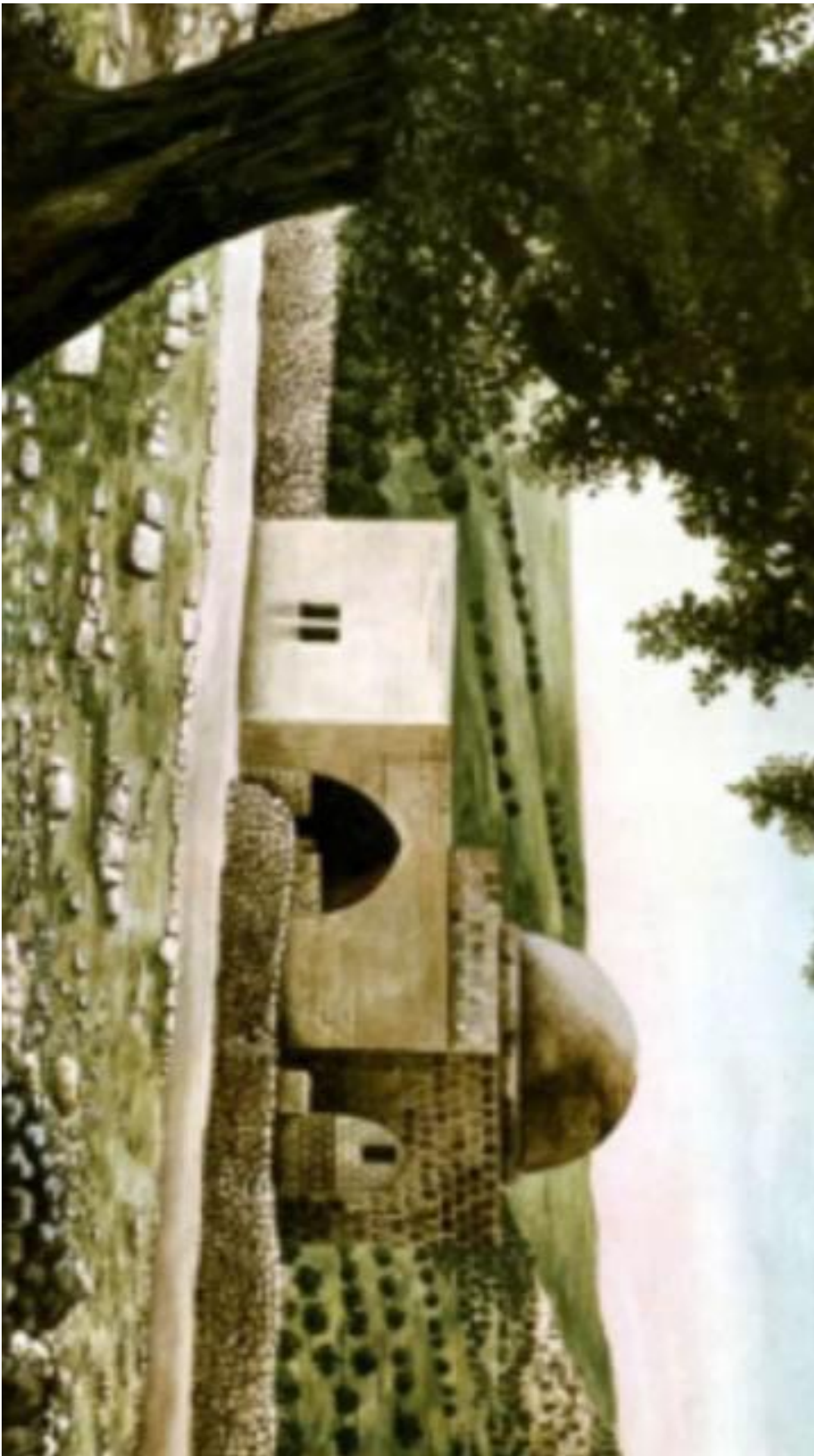
Rachel's tomb today, https://www.chabad.org/library/article_cdo/aid/602502/jewish/Rachels-Tomb-Kever-Rachel.htm