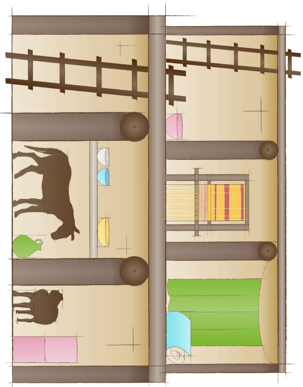
Typical 1 st Century AD Jewish Home