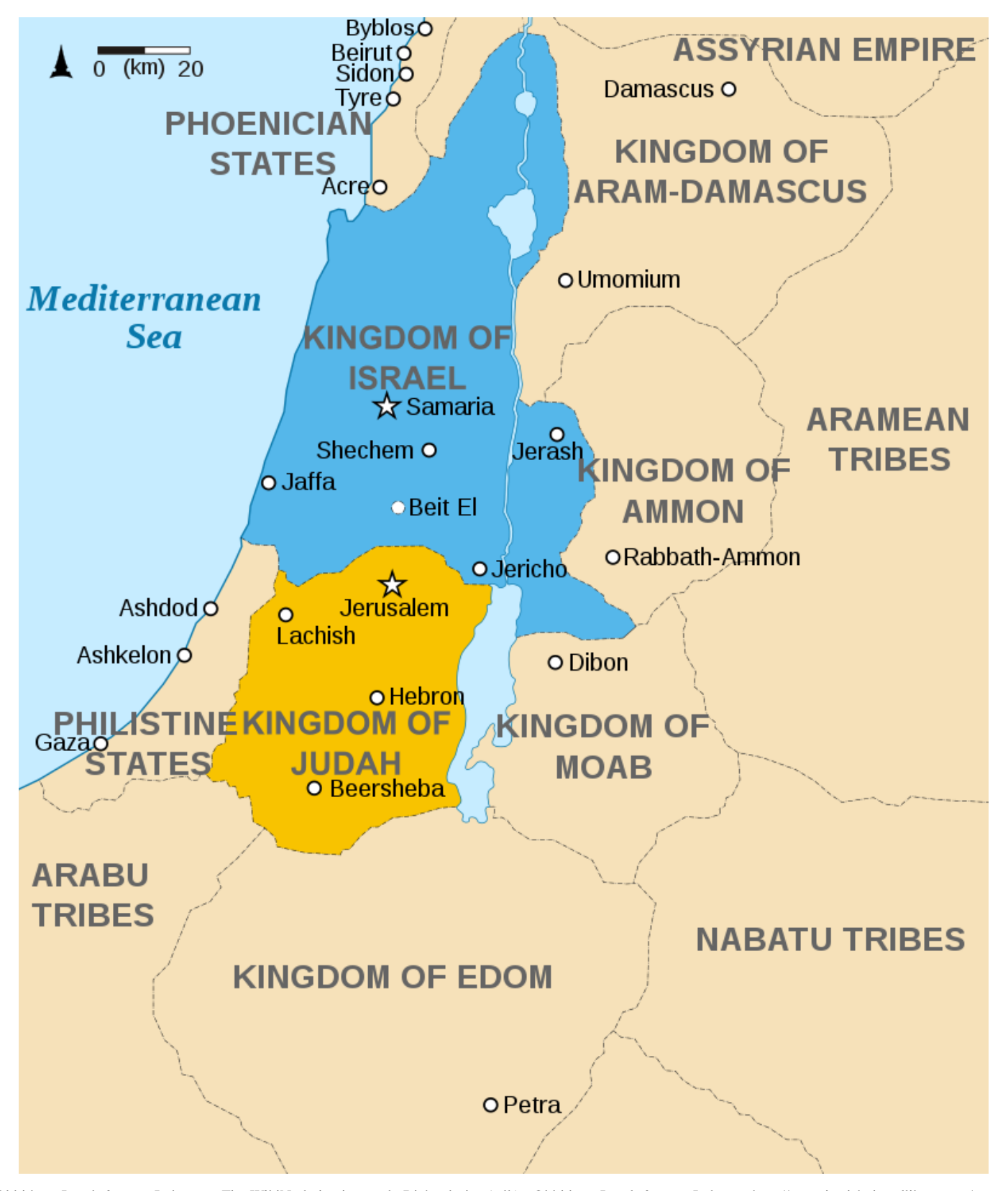
By Oldtidens_Israel_&_Judea.svg: FinnWikiNoderivative work: Richardprins (talk) - Oldtidens_Israel_&_Judea.svghttp://www.jewishvirtuallibrary.org/map-of-israel-and-judah-733-bce, CC BY-SA 3.0, https://commons.wikimedia.org/w/index.php?curid=10872389