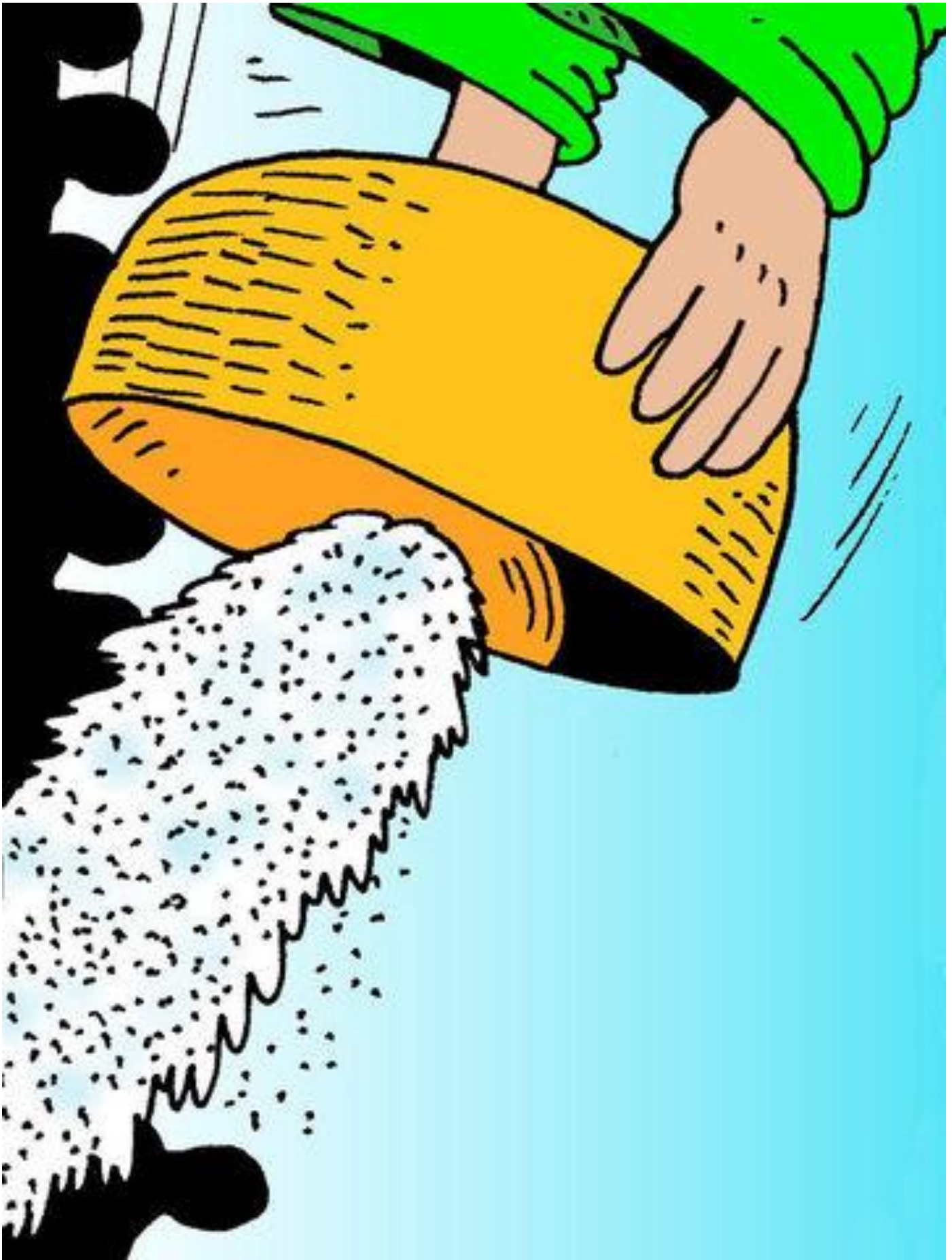
FreeBibleimages :: Elisha and the miracle water :: Elisha puts salt into a spring giving impure water (2 Kings 2:19-22)