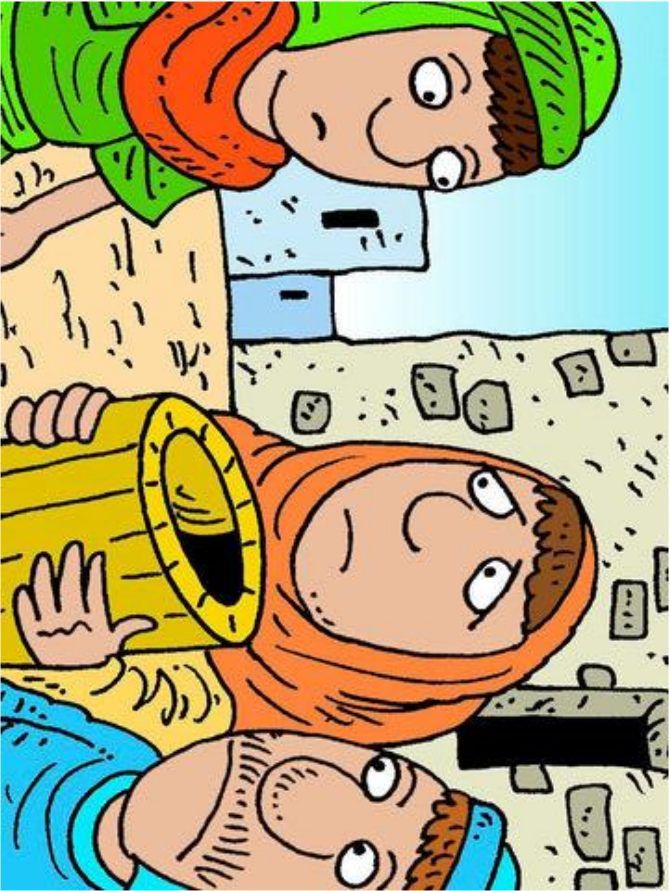
FreeBibleimages :: Elisha and the miracle water :: Elisha puts salt into a spring giving impure water (2 Kings 2:19-22)