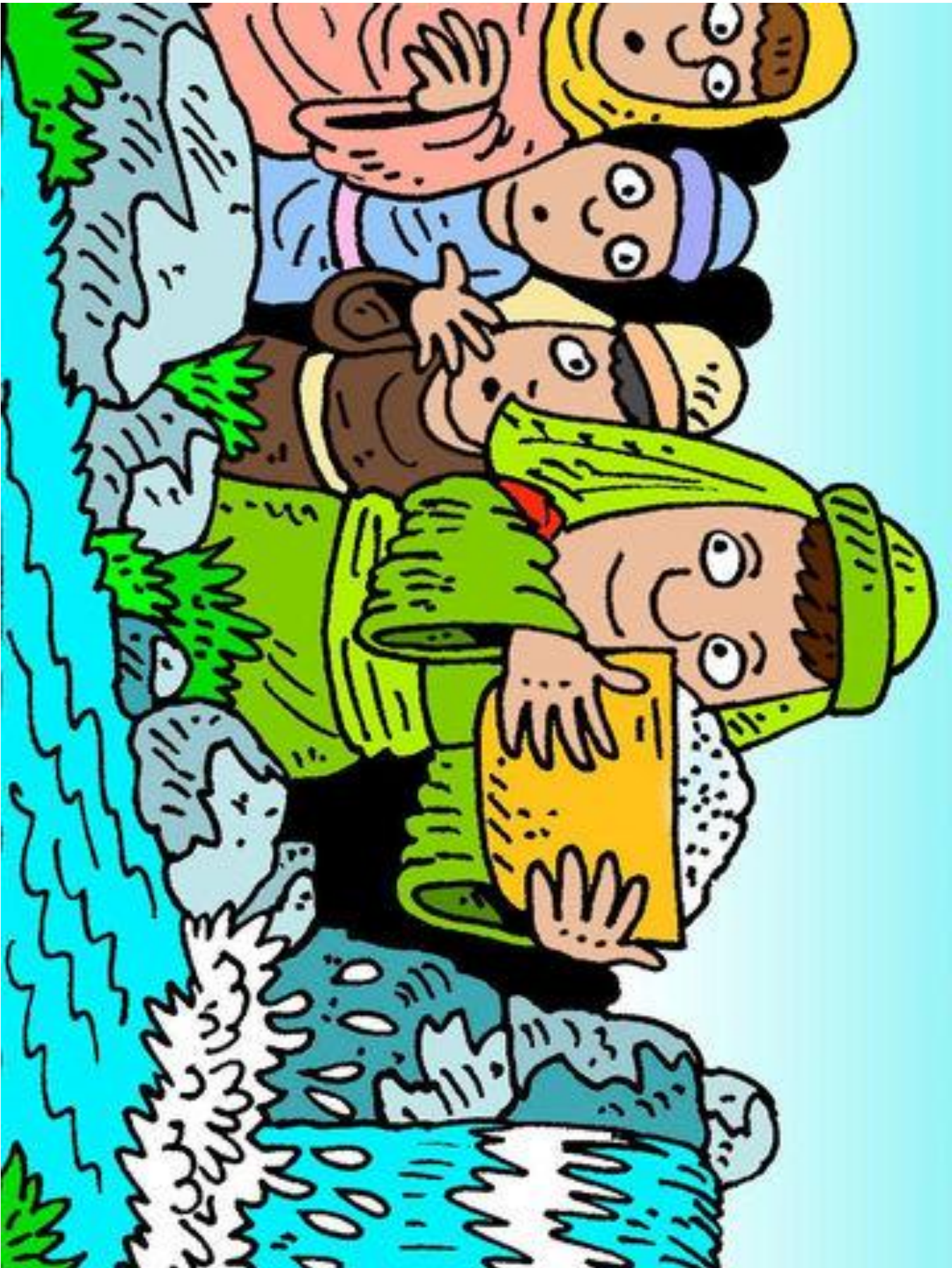
FreeBibleimages :: Elisha and the miracle water :: Elisha puts salt into a spring giving impure water (2 Kings 2:19-22)