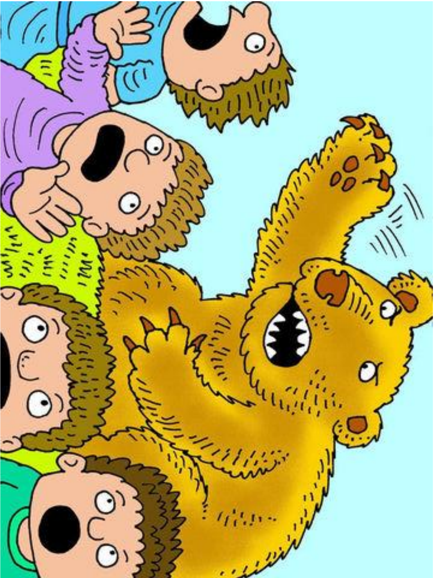
FreeBibleimages :: Elisha and the bears :: Two bears come to Elisha's rescue when he is threatened by a gang of mocking youths (2 Kings 2:23-25)