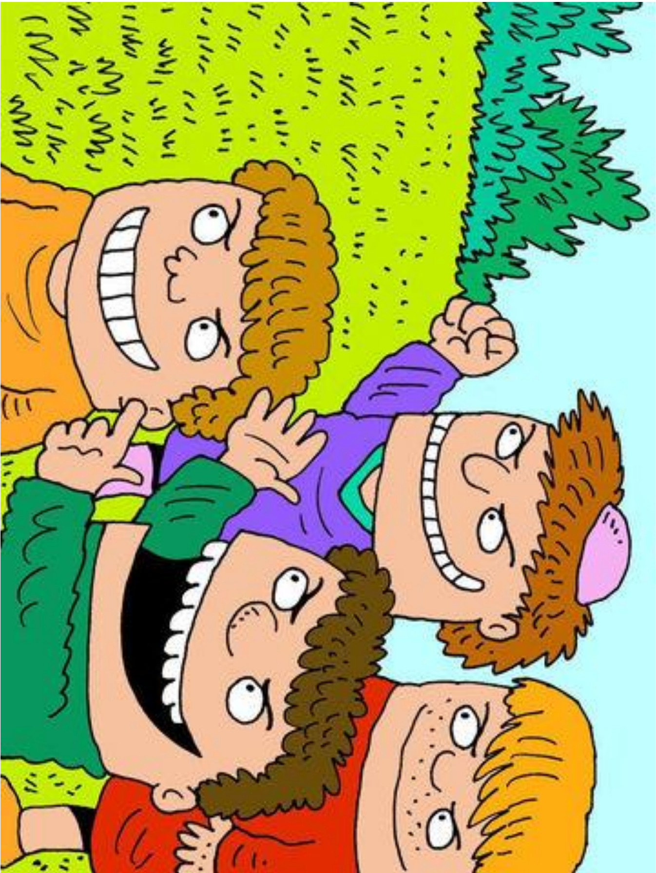
FreeBibleimages :: Elisha and the bears :: Two bears come to Elisha's rescue when he is threatened by a gang of mocking youths (2 Kings 2:23-25)