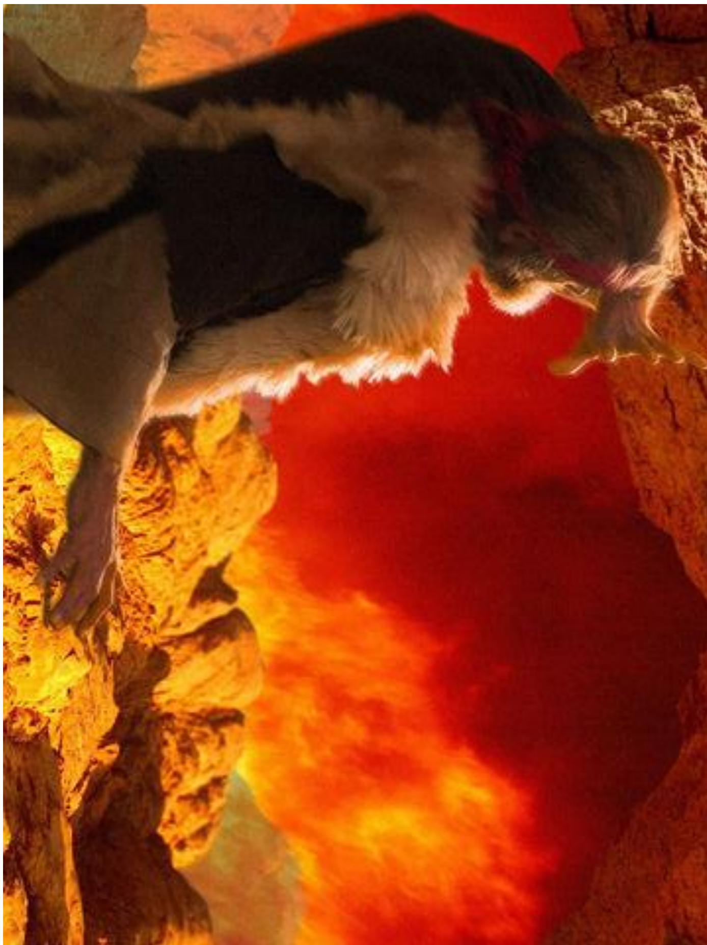
FreeBibleimages :: Elijah flees to Horeb :: Elijah flees to Mount Horeb when his life is threatened but hears God voice in a gentle whisper (1 Kings 19:1-18)