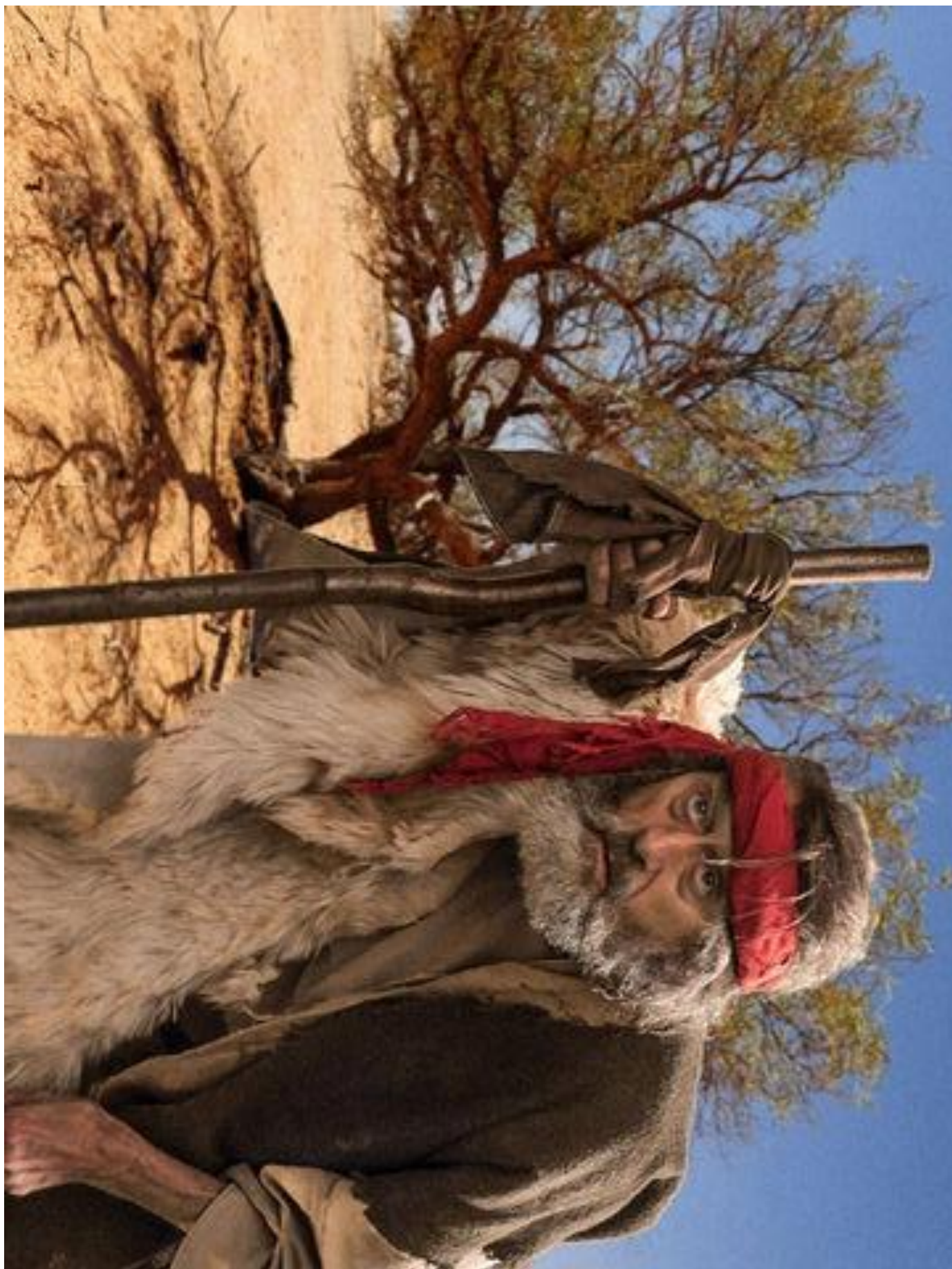
Elijah flees to Horeb :: Elijah flees to Mount Horeb when his life is threatened but hears God voice in a gentle whisper (1 Kings 19:1-18)