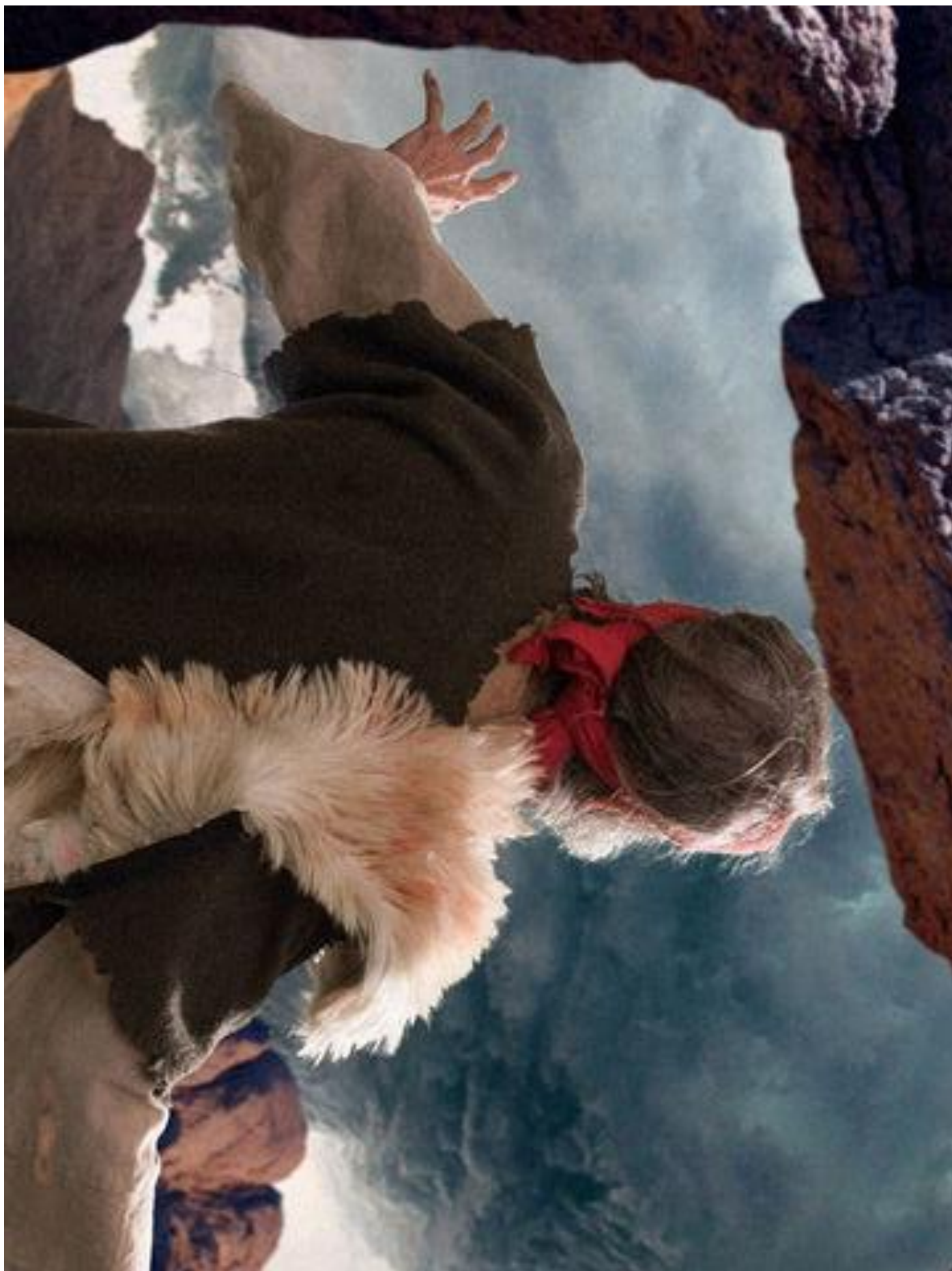
FreeBibleimages :: Elijah flees to Horeb :: Elijah flees to Mount Horeb when his life is threatened but hears God voice in a gentle whisper (1 Kings 19:1-18)