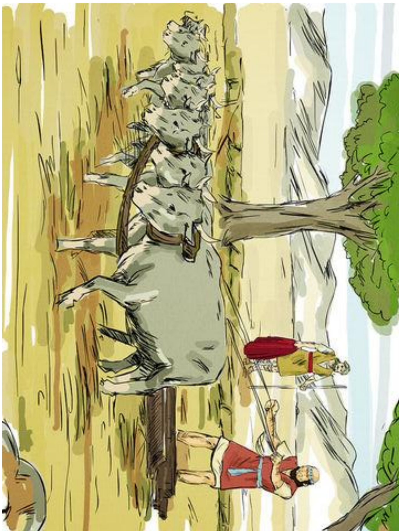
FreeBibleimages :: Elijah anoints Elisha :: Elijah anoints Elisha to succeed him as God requested (1 Kings 19:16, 19-21)