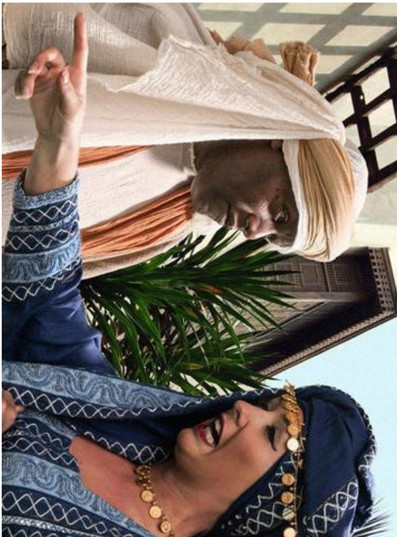
FreeBibleimages :: Elijah flees to Horeb :: Elijah flees to Mount Horeb when his life is threatened but hears God voice in a gentle whisper (1 Kings 19:1-18)