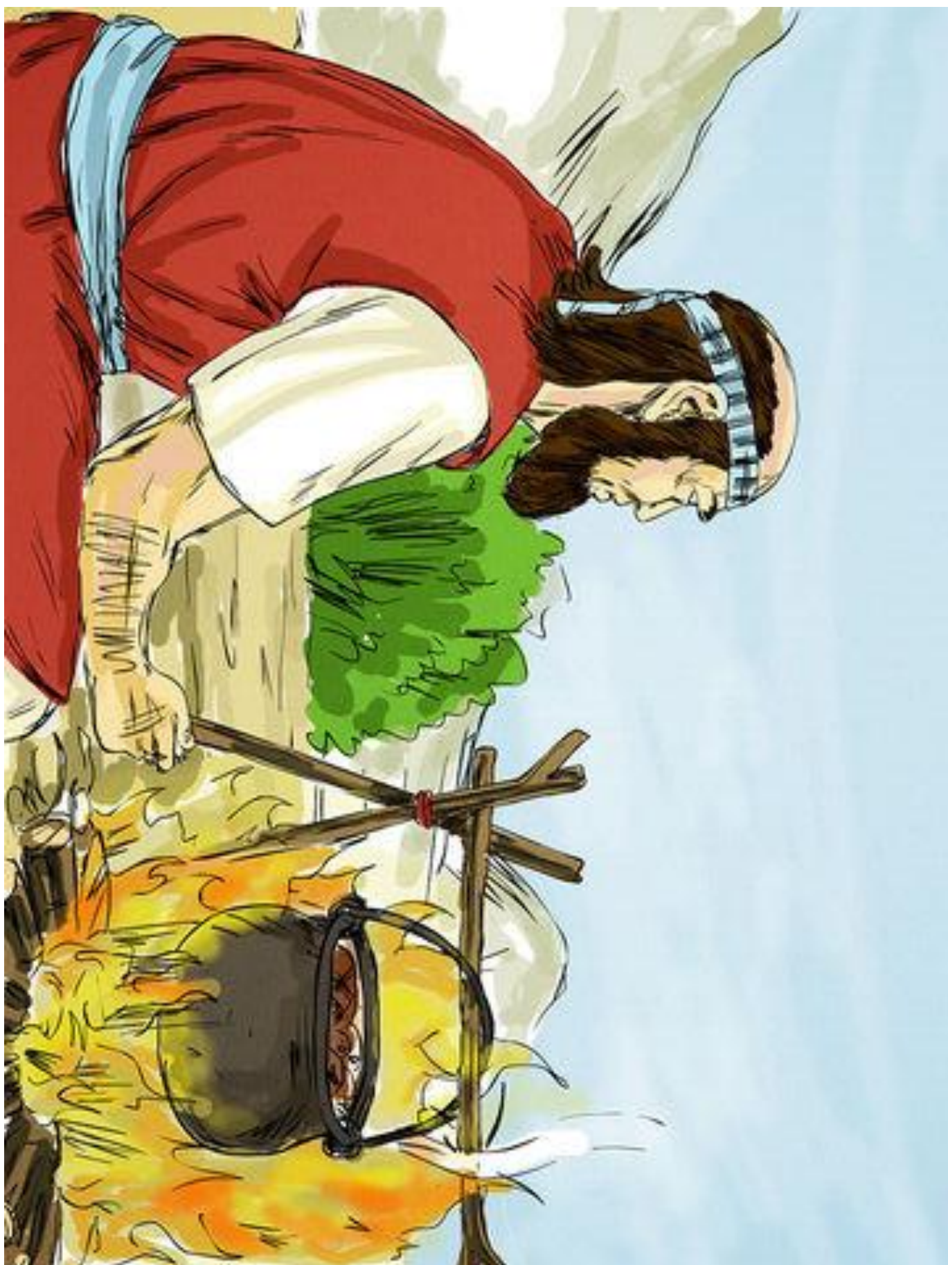
FreeBibleimages :: Elijah anoints Elisha :: Elijah anoints Elisha to succeed him as God requested (1 Kings 19:16, 19-21)