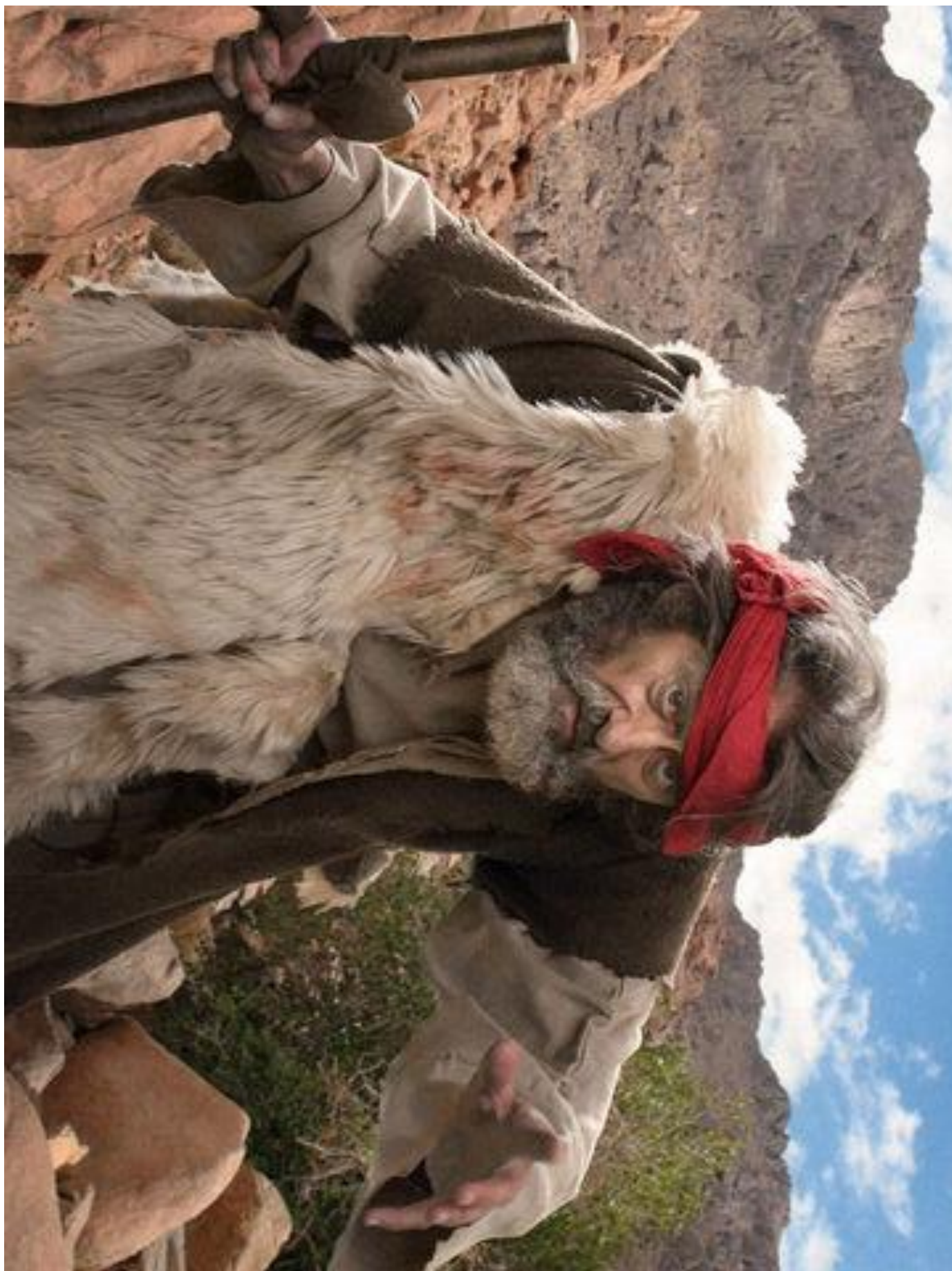
FreeBibleimages :: Elijah flees to Horeb :: Elijah flees to Mount Horeb when his life is threatened but hears God voice in a gentle whisper (1 Kings 19:1-18)