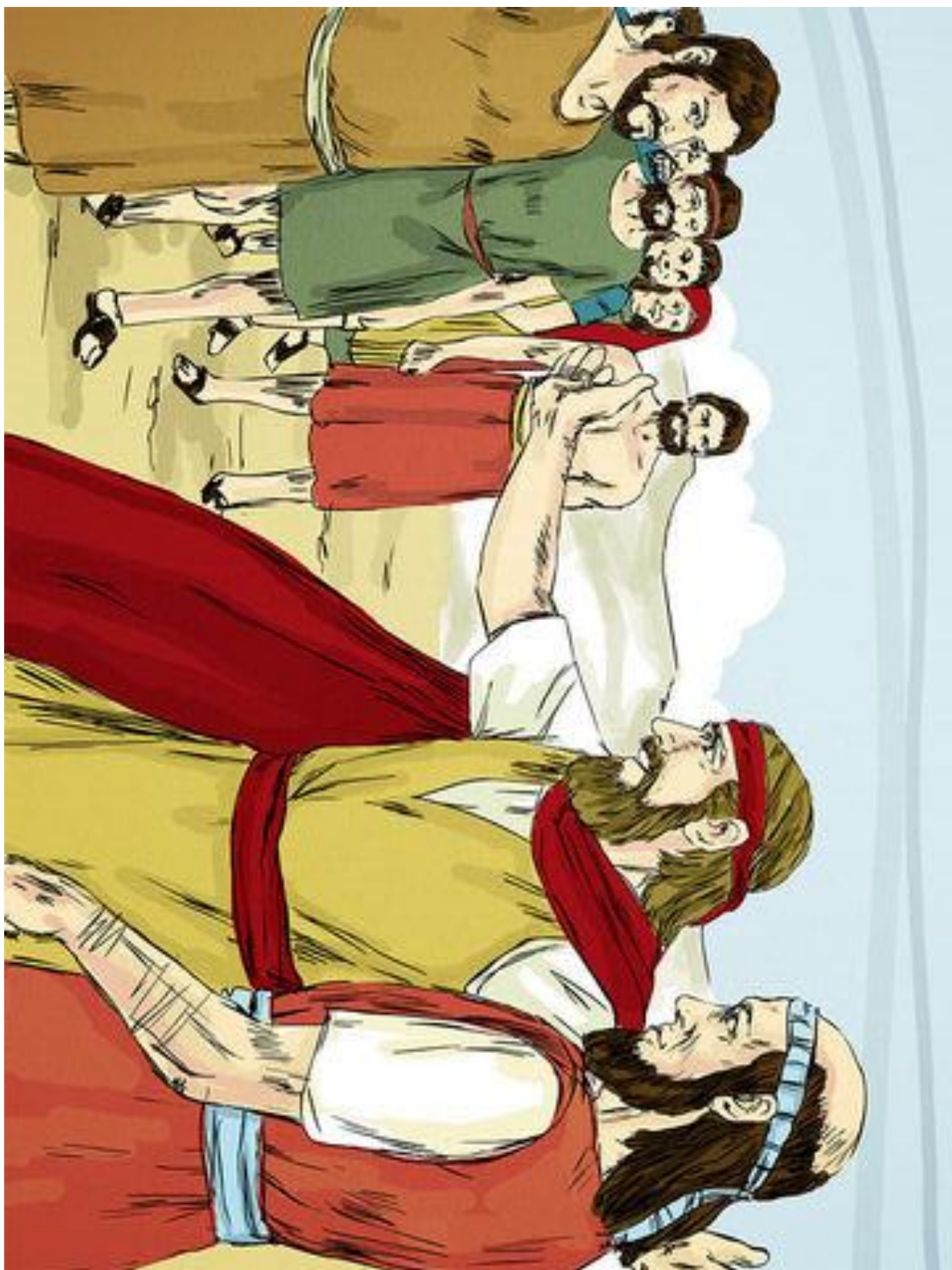
Elijah anoints Elisha :: Elijah anoints Elisha to succeed him as God requested (1 Kings 19:16, 19-21)