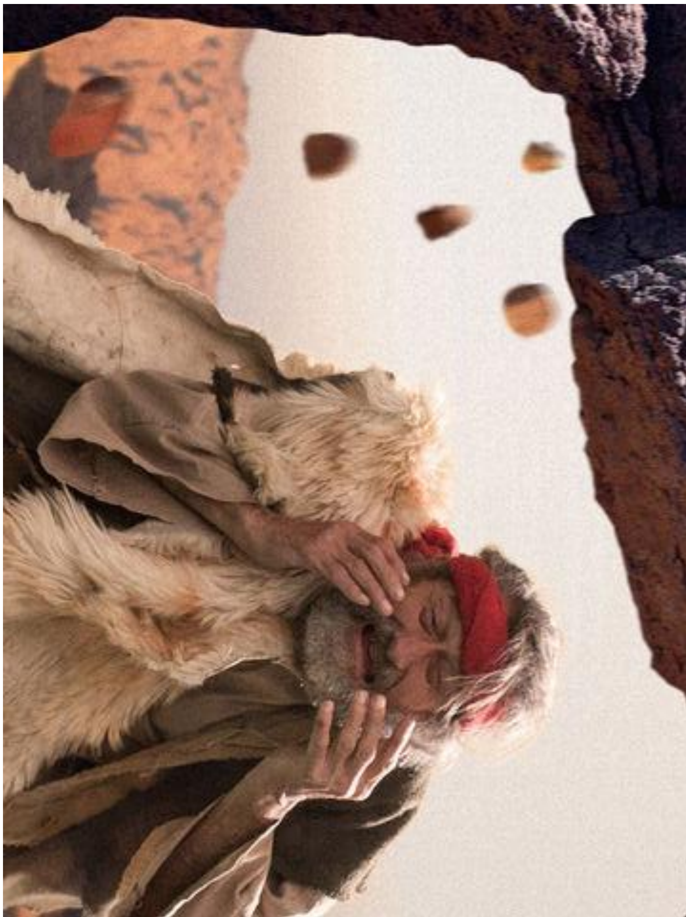
FreeBibleimages :: Elijah flees to Horeb :: Elijah flees to Mount Horeb when his life is threatened but hears God voice in a gentle whisper (1 Kings 19:1-18)