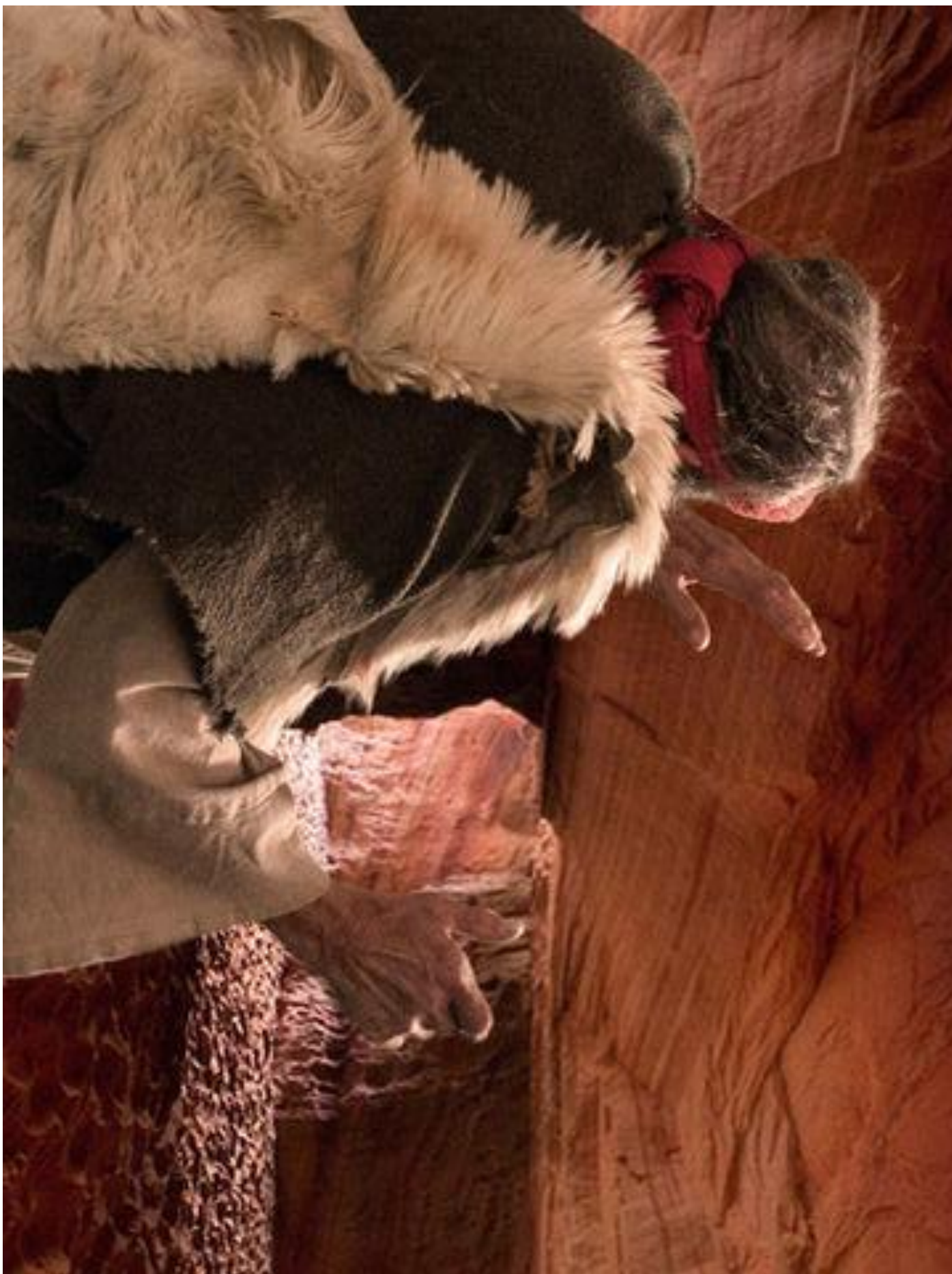
FreeBibleimages :: Elijah flees to Horeb :: Elijah flees to Mount Horeb when his life is threatened but hears God voice in a gentle whisper (1 Kings 19:1-18)