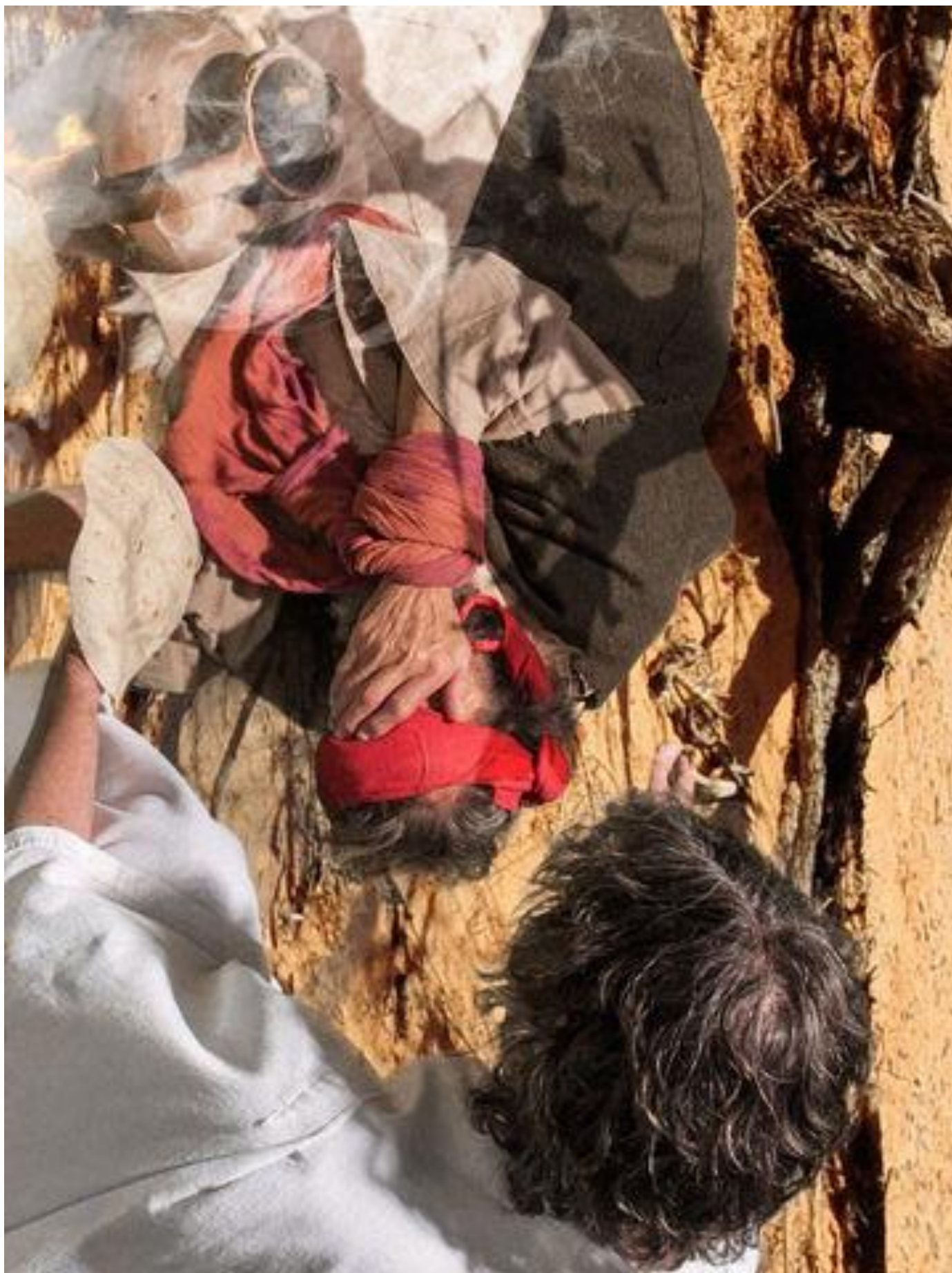
Elijah flees to Horeb :: Elijah flees to Mount Horeb when his life is threatened but hears God voice in a gentle whisper (1 Kings 19:1-18)