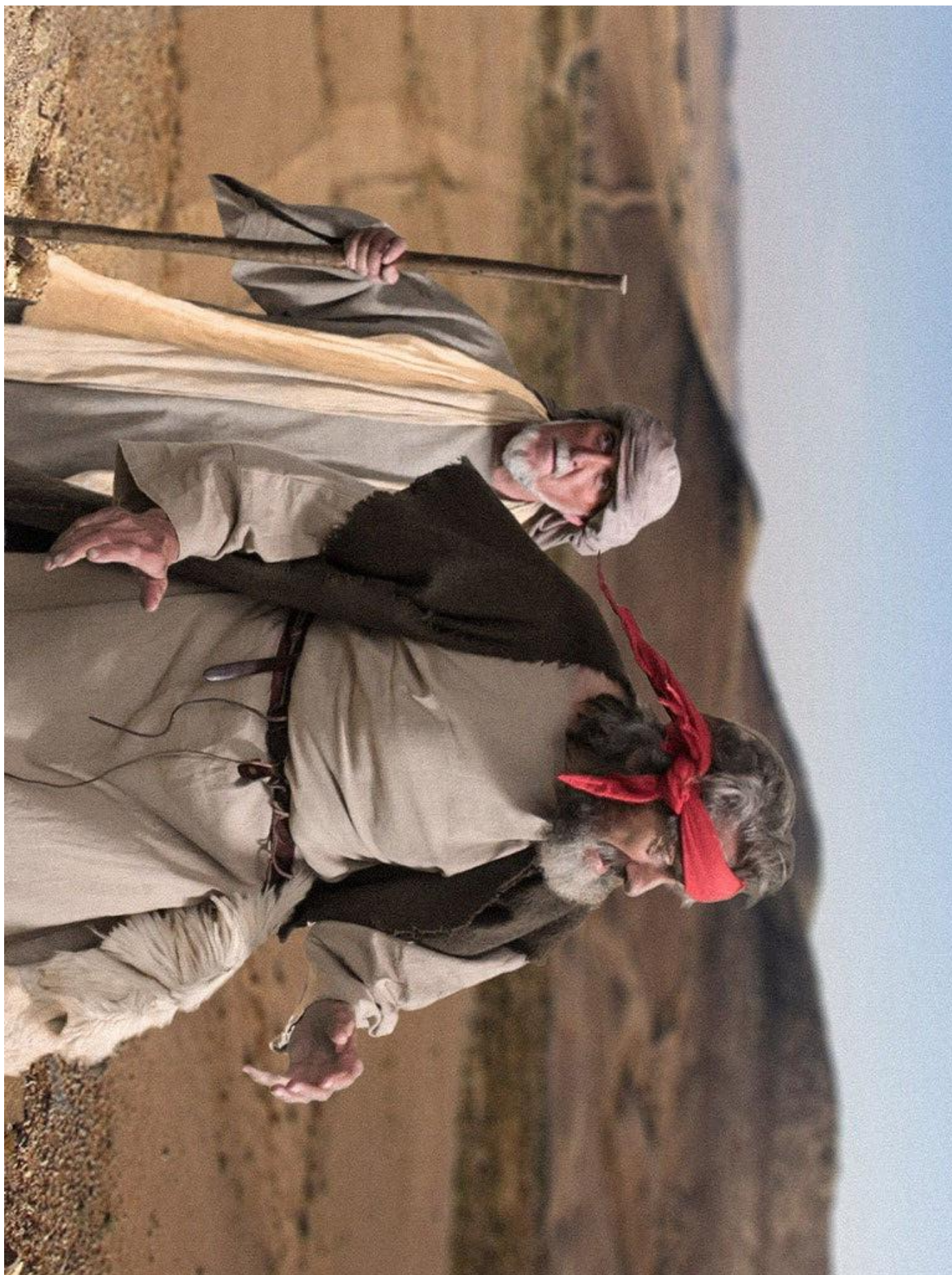
Elijah flees to Horeb :: Elijah flees to Mount Horeb when his life is threatened but hears God voice in a gentle whisper (1 Kings 19:1-18)