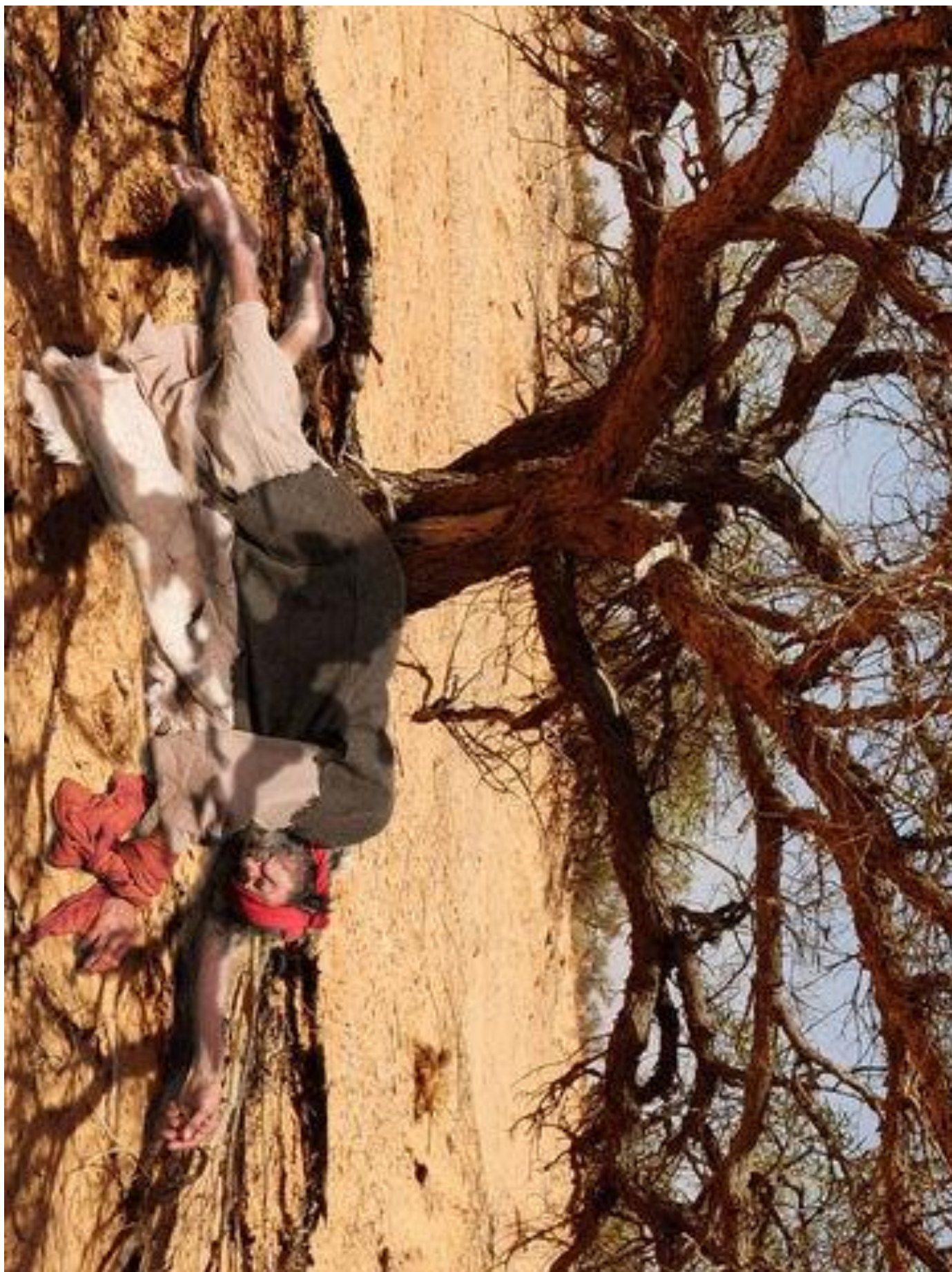
Elijah flees to Horeb :: Elijah flees to Mount Horeb when his life is threatened but hears God voice in a gentle whisper (1 Kings 19:1-18)