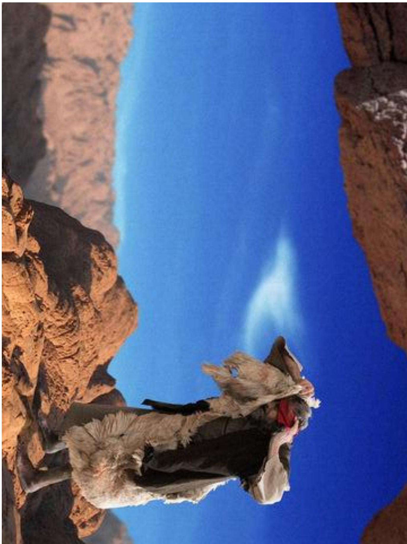
FreeBibleimages :: Elijah flees to Horeb :: Elijah flees to Mount Horeb when his life is threatened but hears God voice in a gentle whisper (1 Kings 19:1-18)