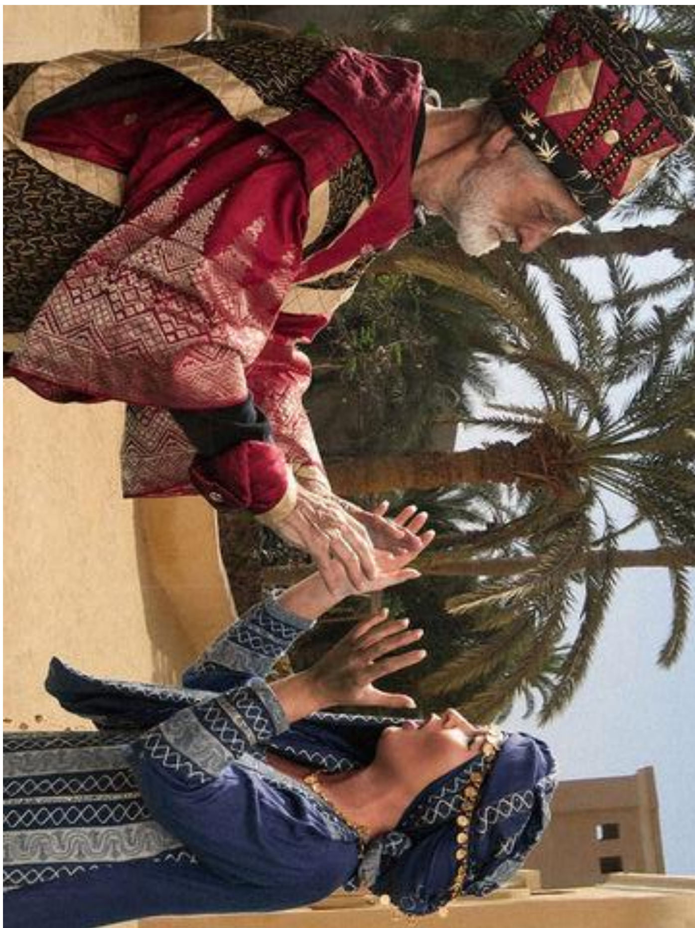
FreeBibleimages :: Elijah flees to Horeb :: Elijah flees to Mount Horeb when his life is threatened but hears God voice in a gentle whisper (1 Kings 19:1-18)