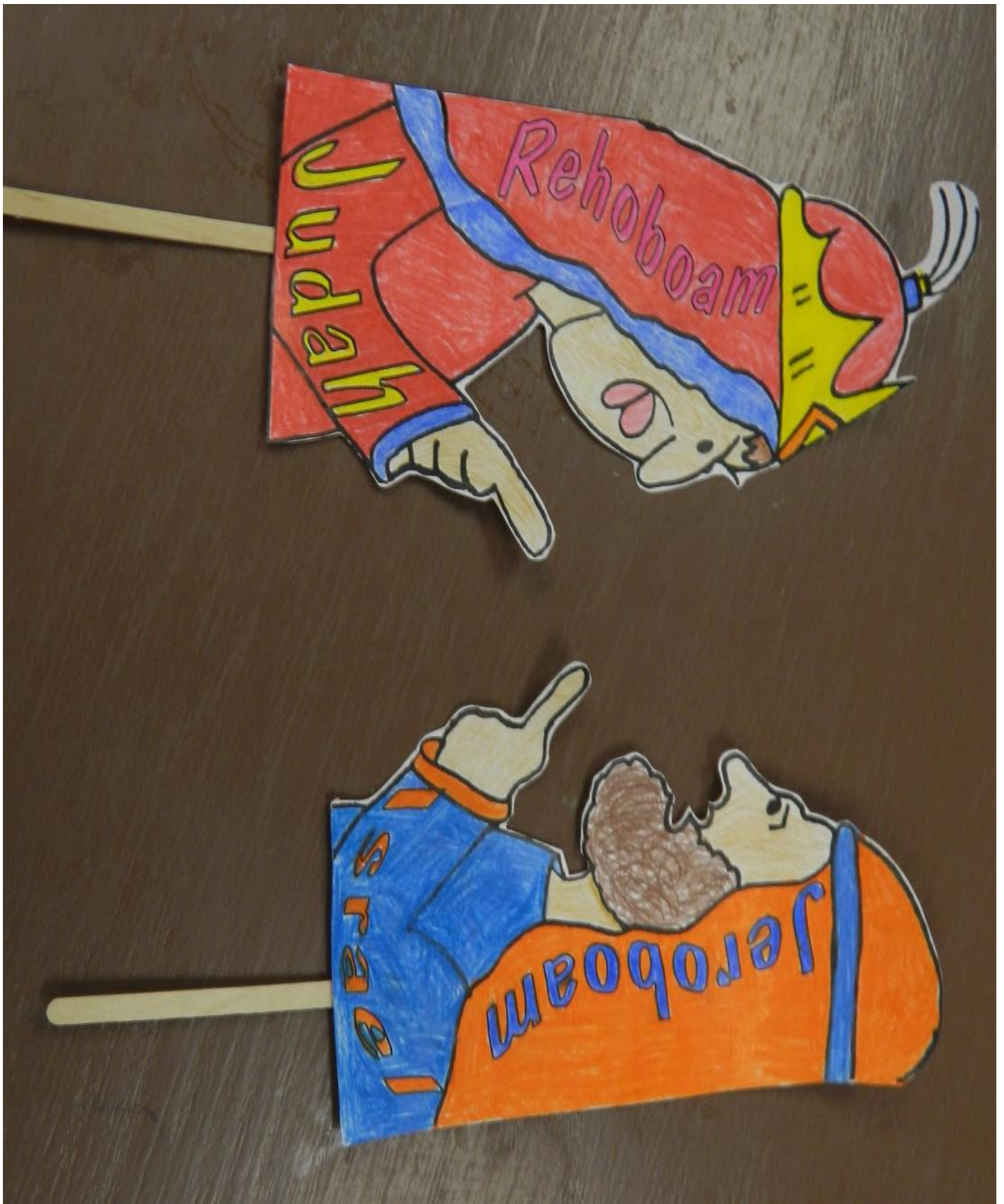
Hands On Bible Teacher: Jeroboam (resized)