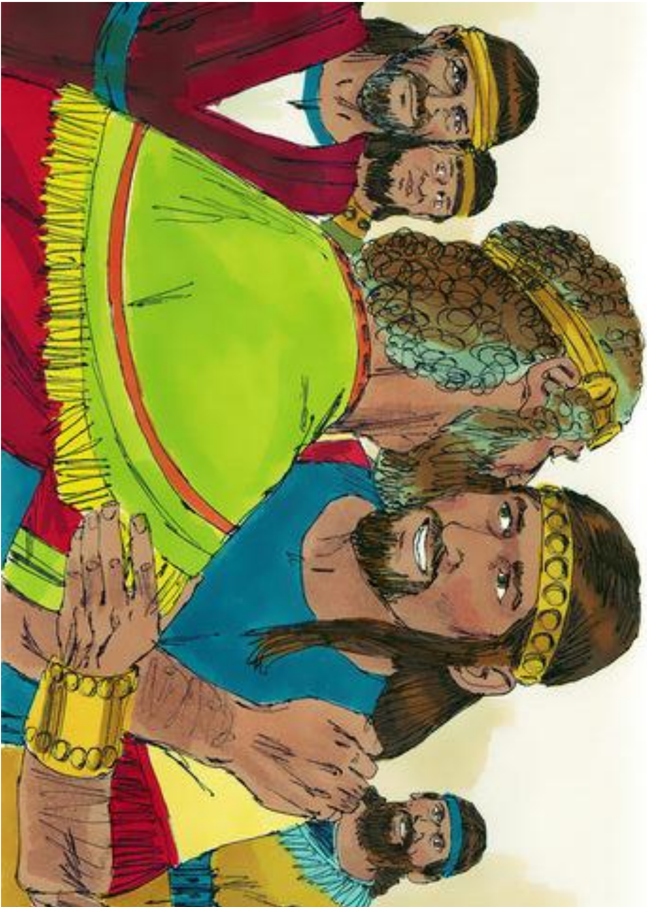
FreeBibleimages :: Absalom rebels against King David :: Absalom leads a rebellion against King David (2 Samuel 15:1 - 18:33)