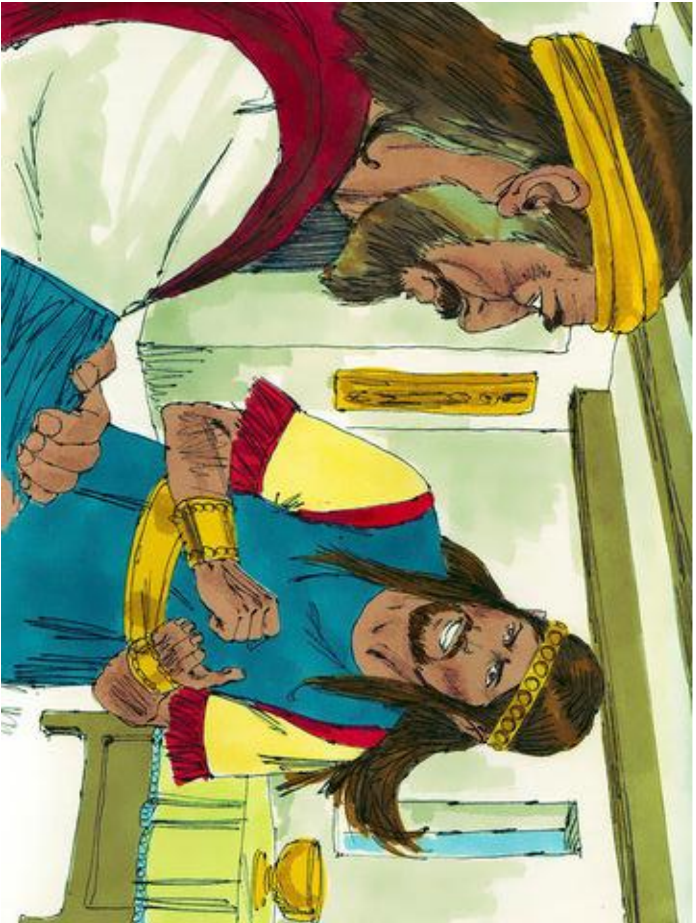
FreeBibleimages :: Absalom rebels against King David :: Absalom leads a rebellion against King David (2 Samuel 15:1 - 18:33)