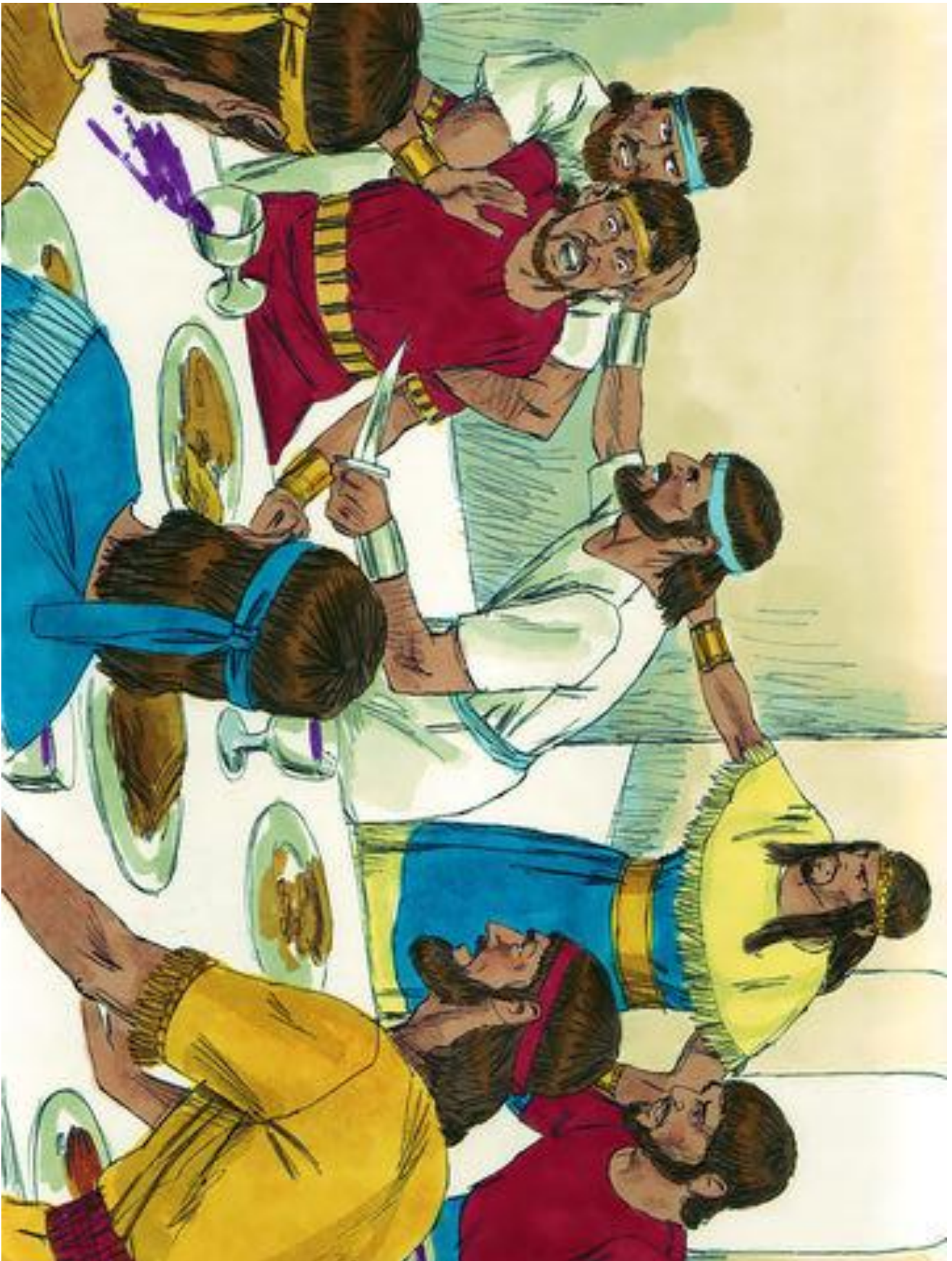
FreeBibleimages :: Absalom rebels against King David :: Absalom leads a rebellion against King David (2 Samuel 15:1 - 18:33)