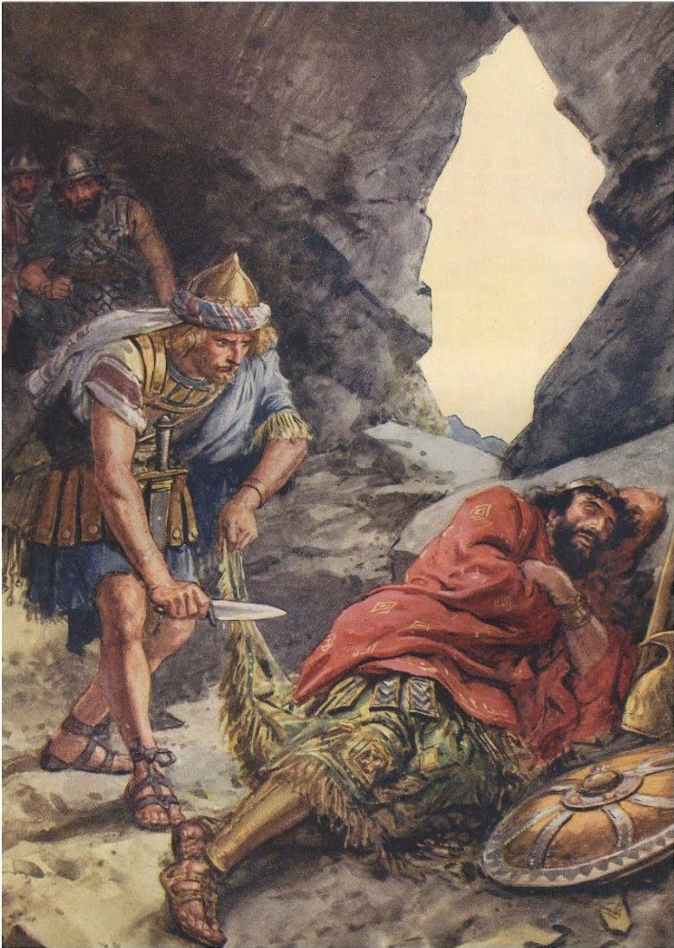
This picture is by an artist whose last name is Brock and shows King Saul asleep. (site resource unknown)