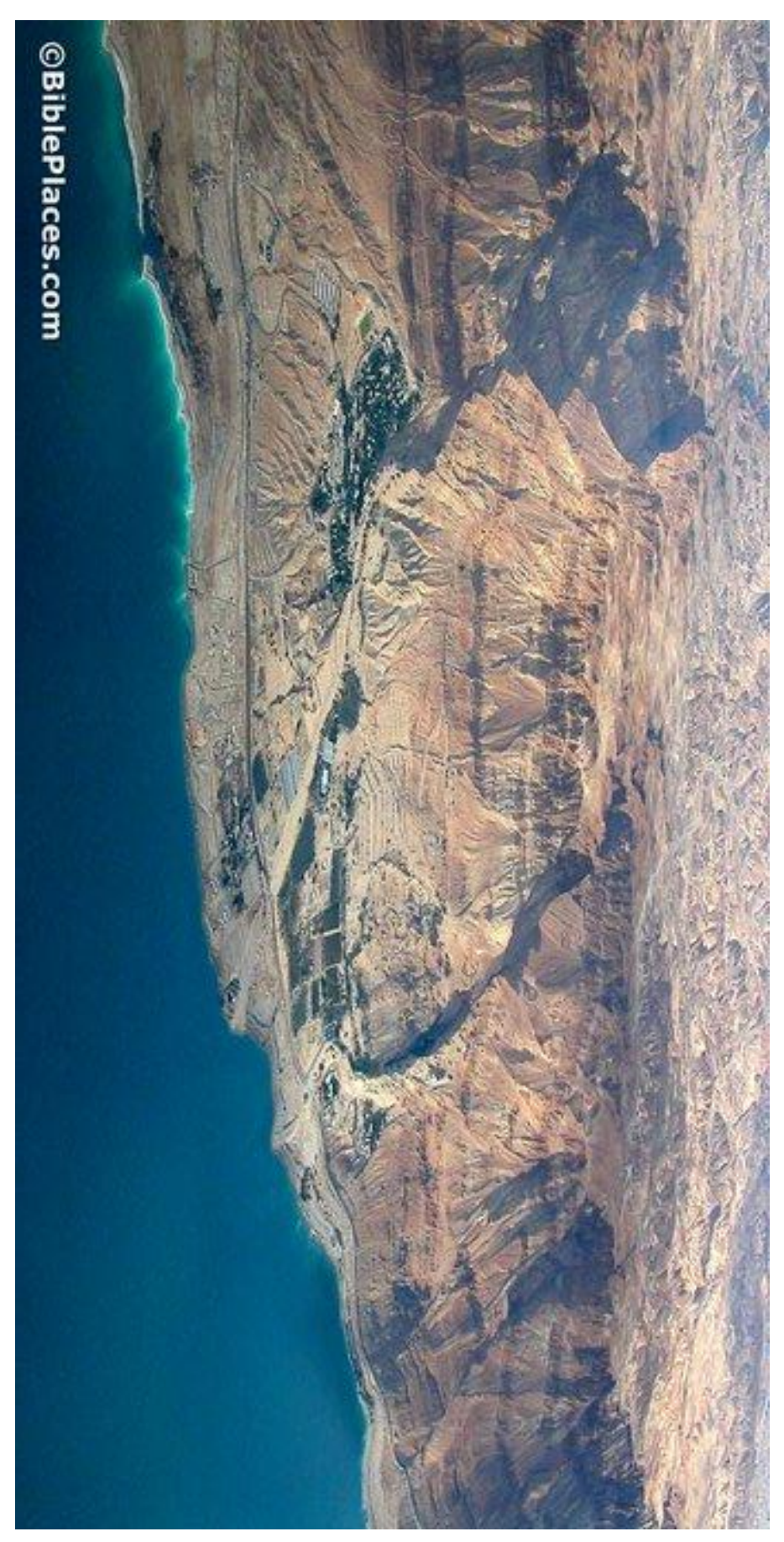
The Strongholds of Engedi (BiblePlaces on Twitter: ""And David went up from there and lived in the strongholds of En Gedi" (1 Sam 23:29). http://t.co/D78JrtQTiJ" / Twitter)