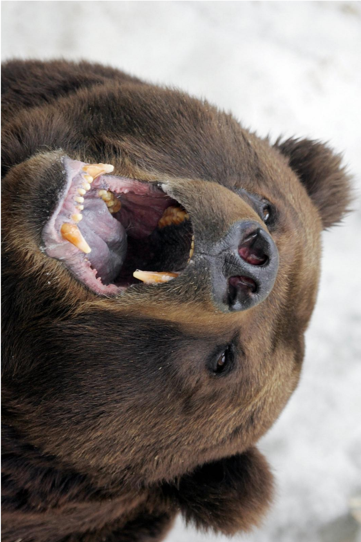
brown-bear-attack.jpg (1600×1062)