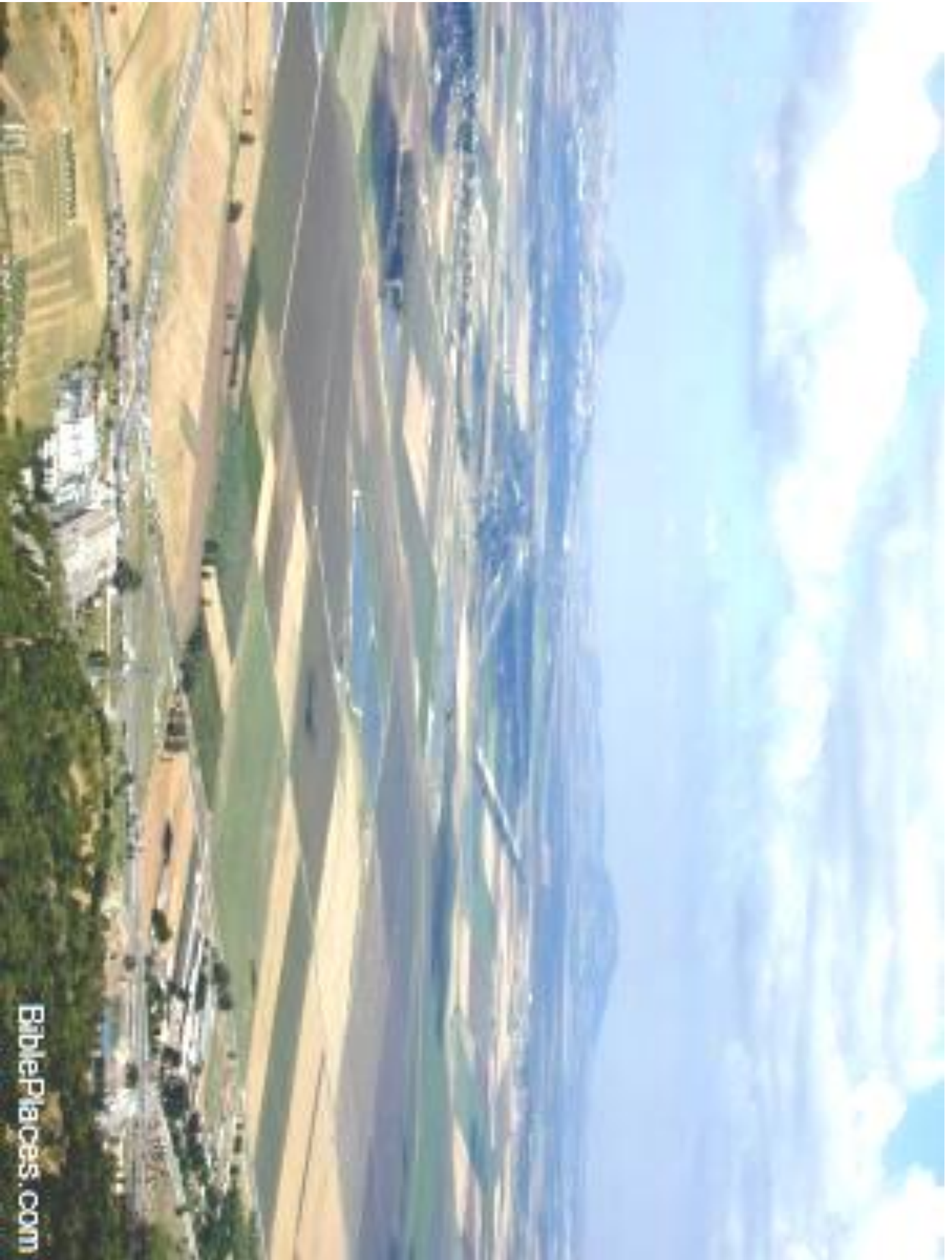
Present-day Jezreel Valley