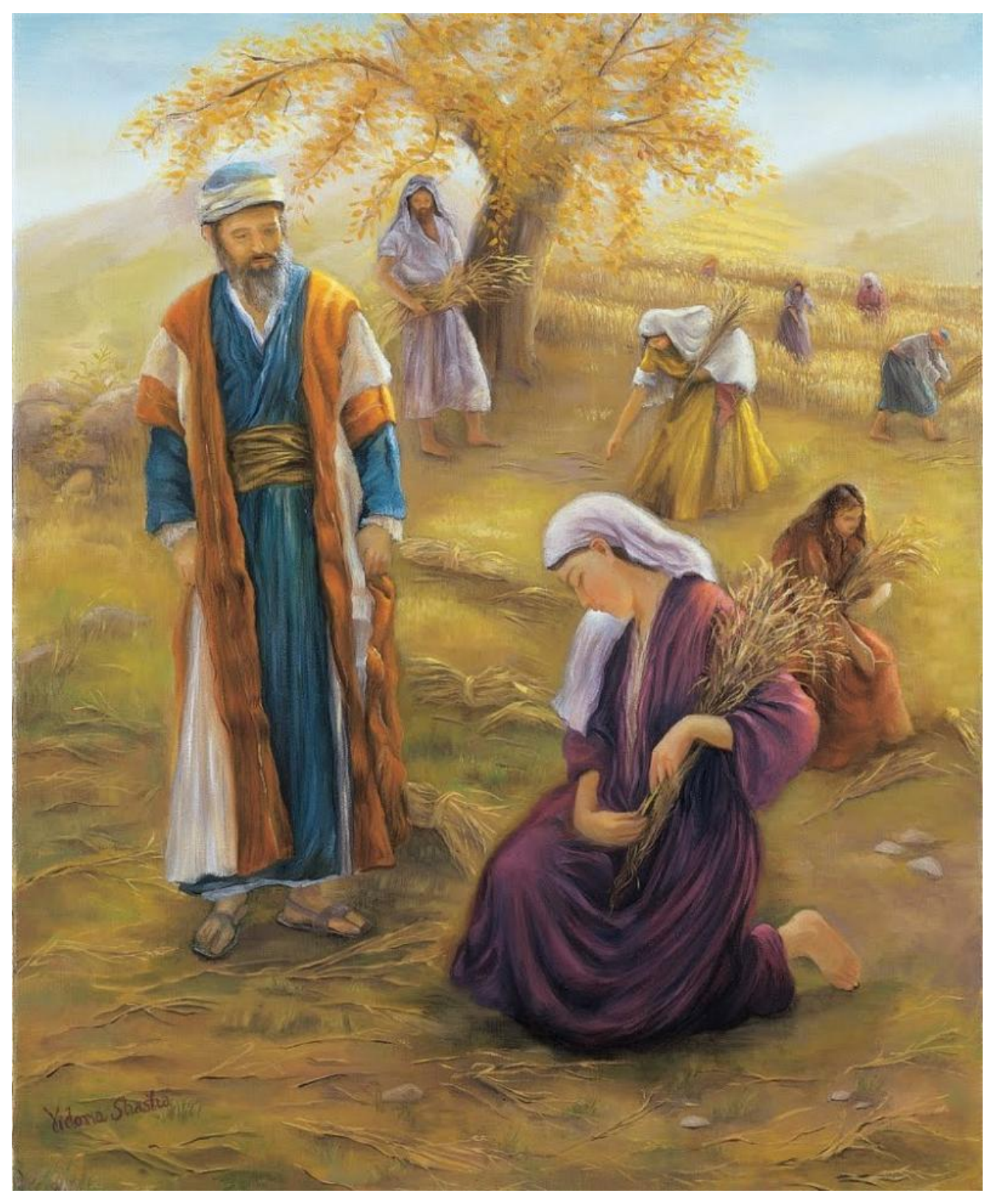
https://www.toughquestions answered. or g/2015/08/07/commentary-on-the-book-of-ruth/