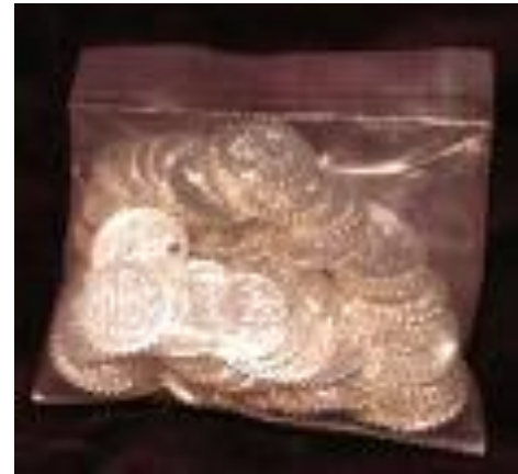
200 Silver Shekels Used by Micah's Mother to Make Idols (100 shekels in each bag)