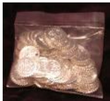
Micah's 1100 Silver Shekels (100 shekels in each bag)