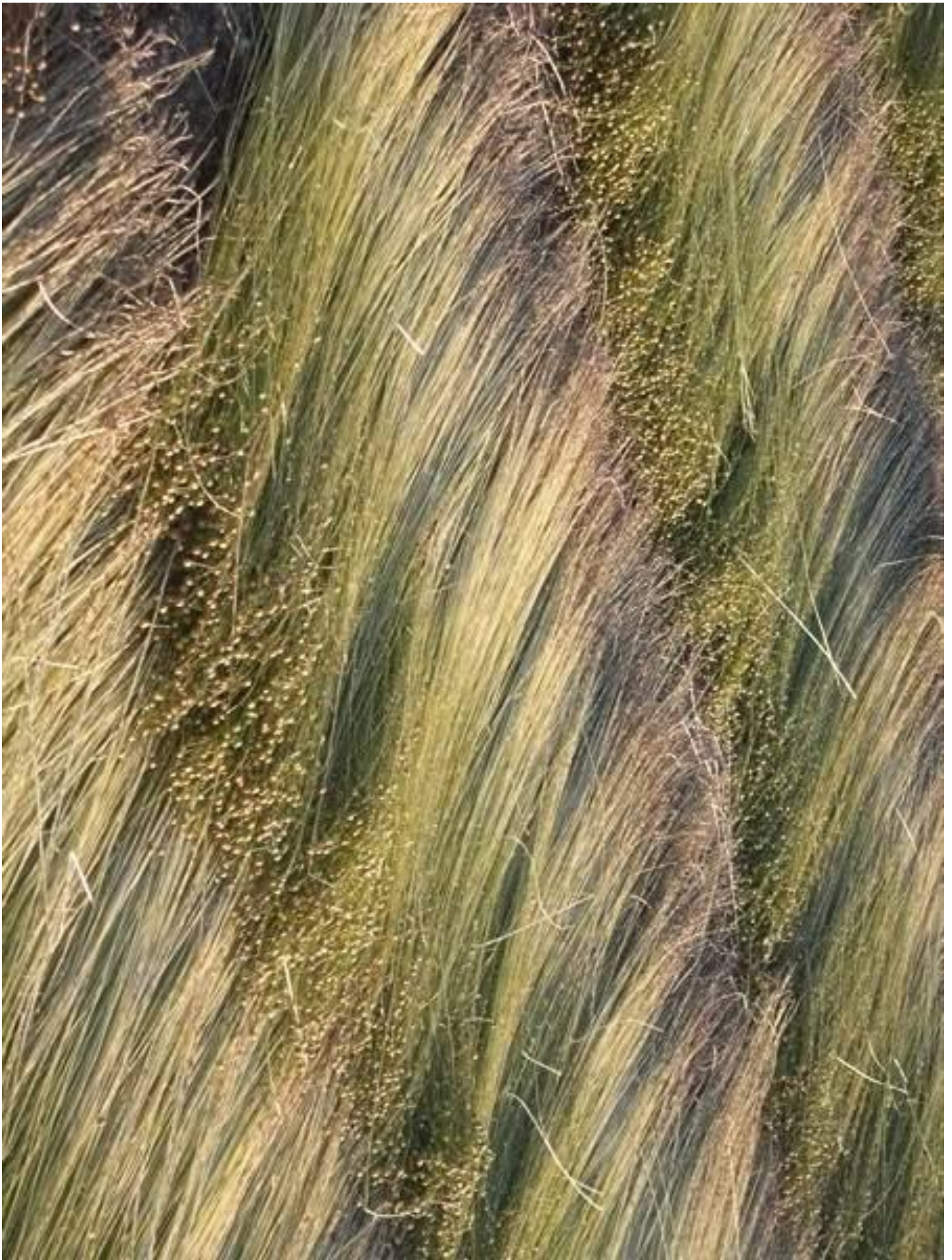
Drying flax ( http://www.ac.aup.fr/~a14631/photos/capture-release_gallery/flax_drying.htm )