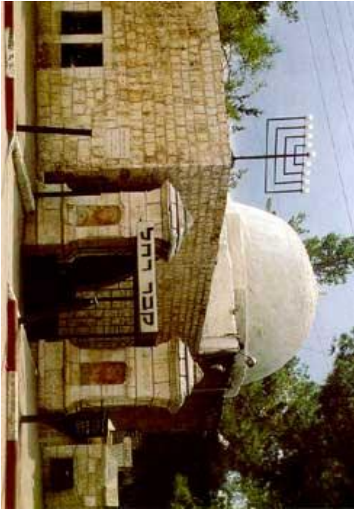
Rachel's Tomb as it appears today 1 Samuel 10:2 states Rachel's tomb is in the territory of Benjamin at Zelzah.