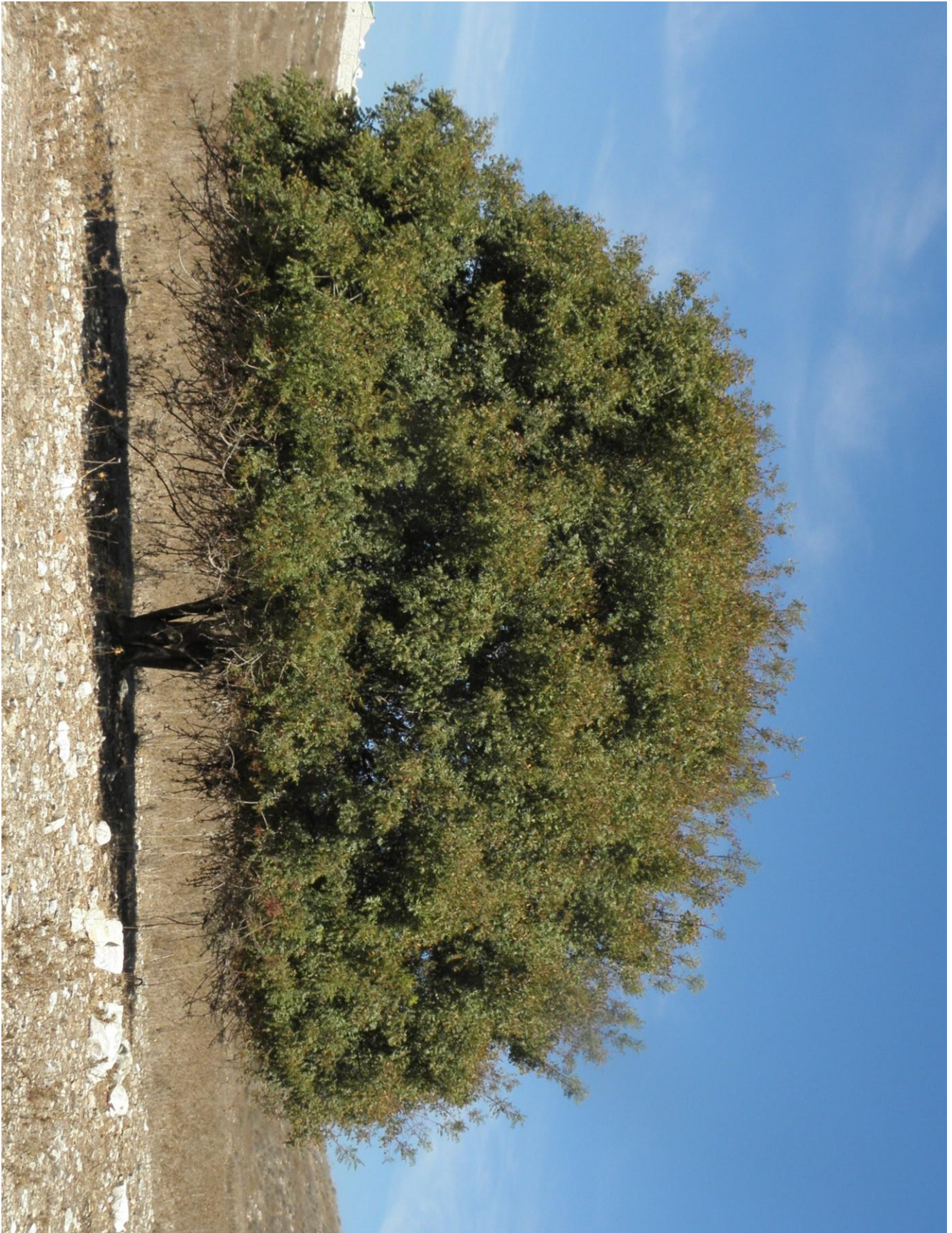
Terebinth tree ( https://en.wikipedia.org/wiki/Pistacia_palaestina )