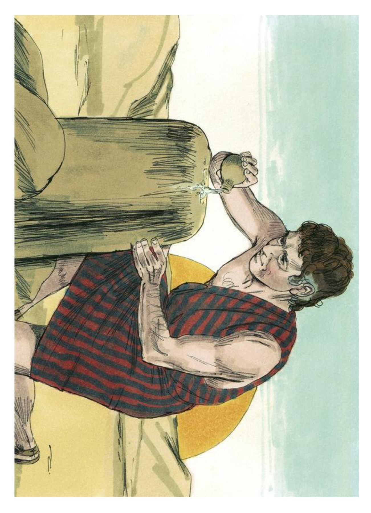
By\ Distant\ Shores\ Media/Sweet\ Publishing,\ CC\ BY-SA\ 3.0,\ \underline{https://commons.wikimedia.org/w/index.php?curid=18897763}