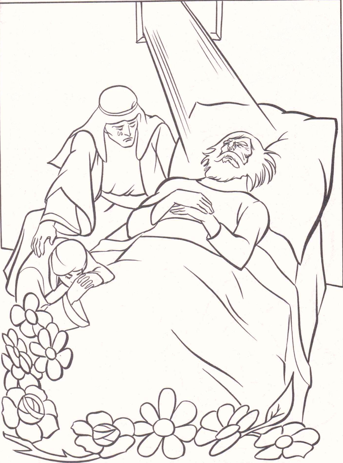
Isaac's father, Abraham, died after living a full and happy life.