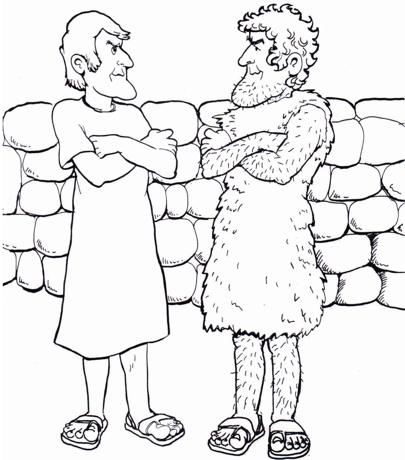
in Faith Roots I