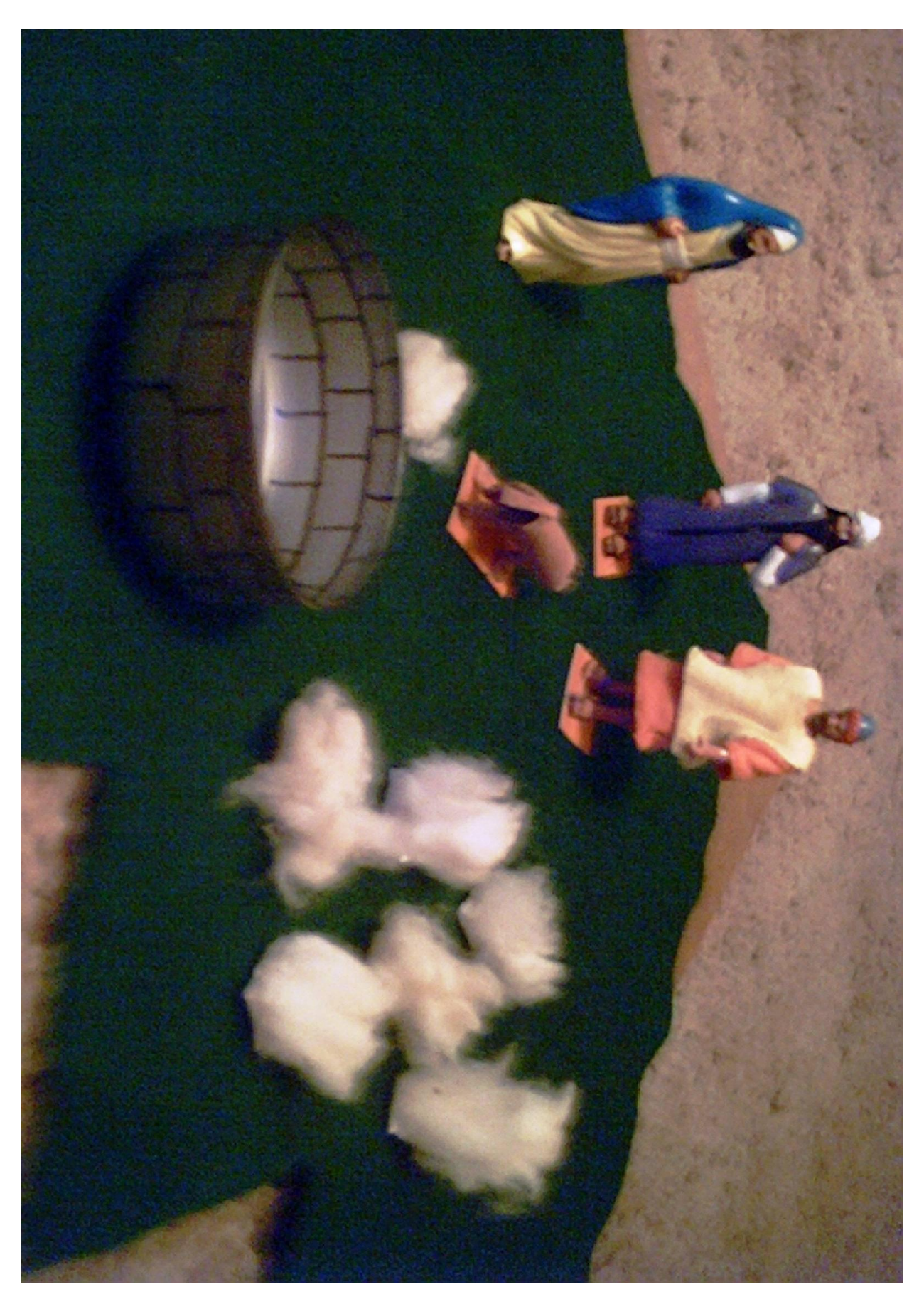
3D presentation of Abimelech part of the story. The well is made from a tuna fish can. The sheep are pieces of sheep skin cut up. The ox is made from a piece of leather stapled to a card stock base. The men are from a set of New Testament people formerly sold through Christian Book Distributors. I don't believe they are available now.